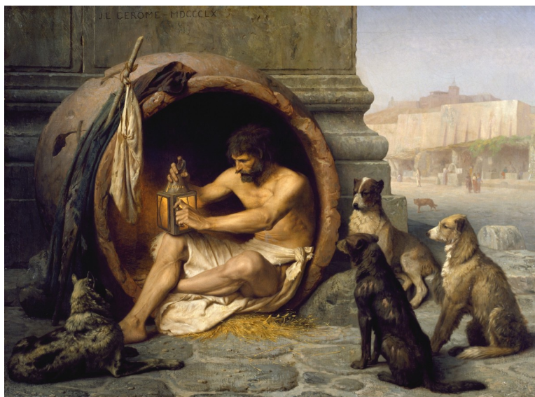
Jean-Léon Gérôme, Diogène, 1860. The Walters Art Museum, Baltimore ( http://art.thewalters.org/detail/31957/diogenes/ ).

ing on the ideological origins of the unity of the sciences in the 19 th century at the moment). No one believes in unity in the context of explanation (evident in the doctrine of ‘emergent properties’), and I don’t believe there are any other issues. Ontological questions about ‘ultimate stuff’ is an absolute dead end and its proponents should be forced to read Carnap until they get it out of their systems.