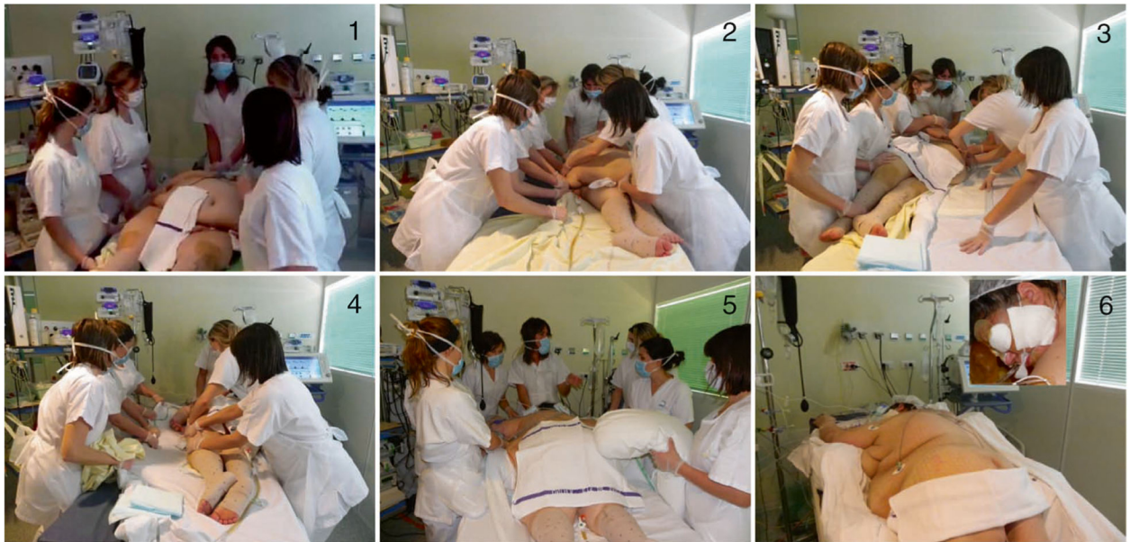
Fig. 2 Prone positioning of obese patients. Step 1: The patient is lying down, under deep sedation and analgesia. One operator is at the head of the patient to secure the airway access, three operators are on the right, two on the left, and one is mobile. Step 2: The monitor is checked. The patient is then turned on the left side first. Step 3: The patient is then moved to the other side of the bed. Step 4: The patient is turned. Step 5: Upper chest and pelvic supports are placed to avoid abdominal compression. Step 6: Finally, compression points are checked regularly, and the head is turned every 2 h. Bed is positioned in a reverse Trendelenburg position

Extracorporeal carbon dioxide removal Use of extracorporeal carbon dioxide removal (ECCO 2 R) in non-obese and obese patients with ARDS is under evaluation [43, 49]. A recent pilot [50] study performed in 20 patients with mild to moderate ARDS and a mean BMI of 30 \pm 7 \text{ kg/m}^2 showed that a low-flow ECCO 2 R device enabled very low tidal volume ventilation with moderate increase in PaCO 2 in patients with mild-to-moderate ARDS. ECCO 2 R is promising in this setting in the obese population, to further avoid volutrauma using very low tidal volumes associated with high PEEP with the aim of avoiding closed alveoli and atelectasis.