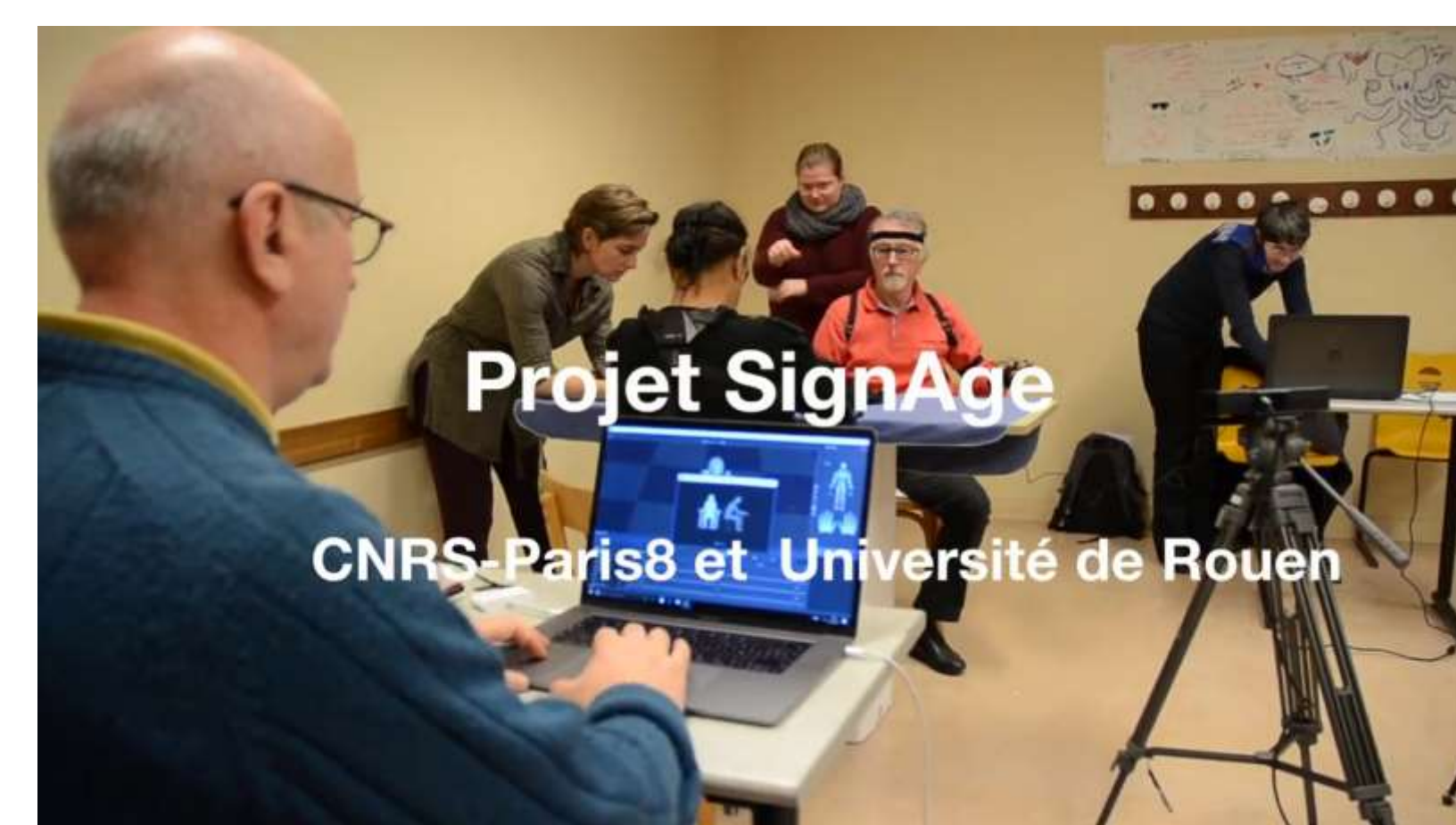
Real-world setup viewing