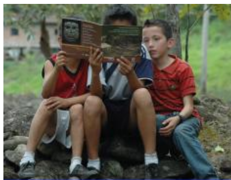
Figure 5 Students reading an explicative brochure at the SALF site.

The purpose of the interpretation centre was to provide the necessary information to understand the nature of the SALF site, describing several of the features the visitors could observe live, in three dimensions. To complement to the archaeological contexts viewed, panels were placed to inform on the features with close-up pictures of some of the objects that were part of the funerary offerings. More descriptive information was posted in different parts of the site that would be visited by following a marked path. Our objective was to provide the history of the site, the MCHM culture and its importance in a series of small captions disseminated throughout the site. These would complement the information given in the brochures and booklets that were distributed (free of charge) to students and organised visit tours (Figure 5). Although statistics have not been formally kept by the municipality of Palanda the 3000 booklets that were printed for the first year for the interpretation centre quickly ran out in less than six months. Considering the fact that the site is situated five kms away from Palanda and 120 kms away from Loja, the largest city in southeastern Ecuador, this is probably one of the most visited open museum sites with an interpretation centre in this part of the country.