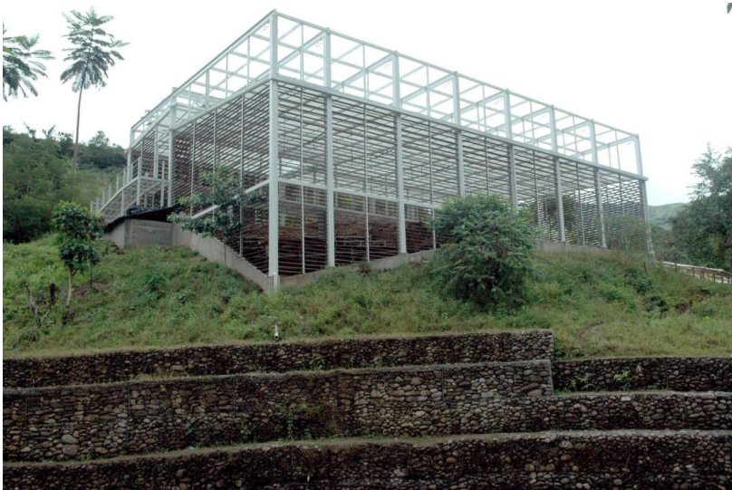
Figure 3 Interpretative center structure protects ancient architecture.

the platform with an elegant, rectangular edifice. It was composed of two parts: An underground concrete retaining wall, built on the solid geological riverbed, served as the base for a large metallic frame covered with a white polycarbonate roof. The walls of the structure were made of thin strips of treated wood that were fixed horizontally, at spaced intervals, as to let in the natural light and assure the normal ventilation of the interior. A particularity of the structure was a hanging bridge-like plank, which crossed the edifice 3 m over the ground, allowing the visitors to oversee the archaeological features and admire the spiral architecture that lay below. The structure covered an internal space of over 300 m 2 (Figure 3 and Figure 4). It was materially impossible to expose the fine archaeological objects excavated on the site; the security