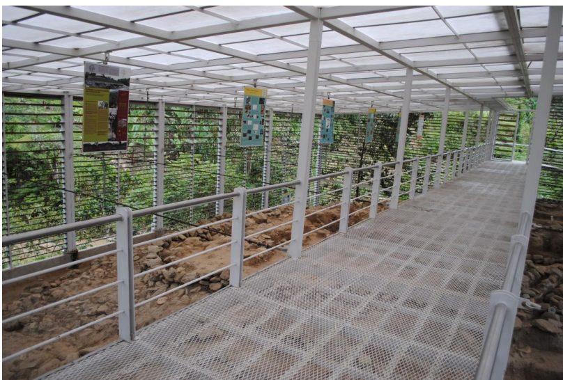
Figure 4 Hanging bridge platform and information panels.