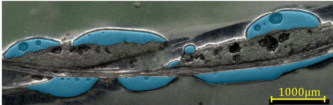
Figure 1. Semipreg fabric cross-section; the PA66 droplets are highlighted in blue

The material used in this study is a powder-impregnated PA66/glass twill 2/2 fabric, provided by Solvay. In its as-supplied state, the matrix is distributed on both faces of the fabric as a network of coalesced droplets (as shown in Figure 1).