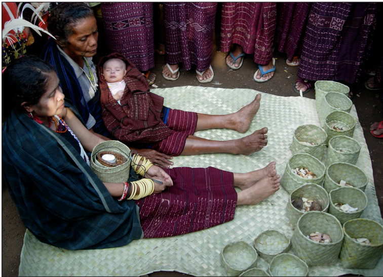
Figure 6. The baby during the lodon ana' ritual, Waiklibang, Kabupaten Flores Timur, Flores, 13 October 2006.

This ritual can be understood as the child's initiation into membership of the clan and into human society in general (Liwun 1986).