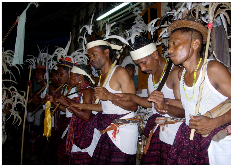
Figure 7. Dancers with swords during a ritual lodon ana' ('bringing down the child'), Riang Kotek, Kabupaten Flores Timur, Flores, 6 November 2006 (photograph by the author).