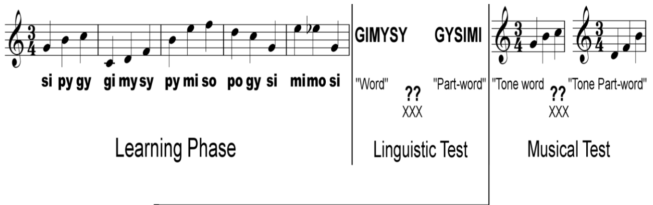
Figure 1: Illustration of the experimental design used in François & Schön 2011. Participants were presented with a statistically structured stream of sung syllables (exposure phase) and then tested with a 2AFC for recognition of both linguistic and musical structures. Stimuli were presented through loudspeakers.