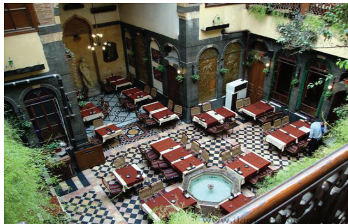
Figure 1: The courtyard of Old Damascus restaurants

These restaurants have the characteristic of houses with courtyards and formerly built to climatic and environmental characteristics specific to the Syrian culture. The courtyard microcosm away from the outside world, gives the house "turned into a restaurant" an unprecedented relationship with nature, the sky, the sun, the fresh air, land, water and vegetation. The house seems to close in on them, but at the same time it is opened directly to the nature. There is a connection between the direct courtyard and the open sky.