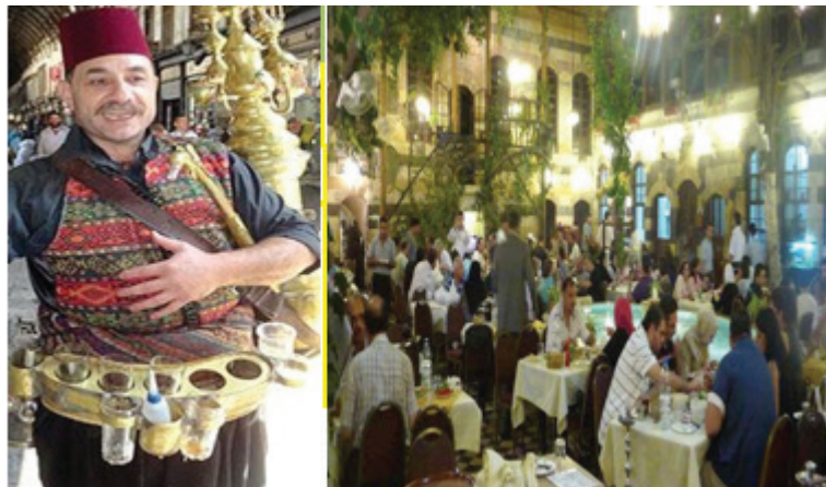
Figure 5: The traditional costume of staff

The traditional attire of staff does not necessarily correspond to the specific clothing worn by the servants of time, but the fact to clothe the servers with, makes it an anachronism not identified by interviewees. These combine the suit first to a cultural dimension matching what they would like to see.