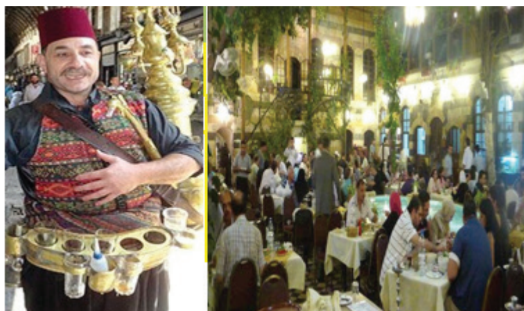
Figure 5: The traditional costume of staff

The traditional attire of staff does not necessarily correspond to the specific clothing worn by the servants of time, but the fact to clothe the servers with, makes it an anachronism not identified by interviewees. These combine the suit first to a cultural dimension matching what they would like to see.