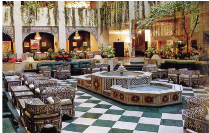
Figure 4: The marquetry furniture

Also in order to remain faithful to the traditional and authentic old houses Damascene, the use of marquetry furniture in some restaurants adds a certain authenticity: “marquetry furniture, yes, there is, and it can be well yes (...) for furniture like chairs or couches is authentic”.