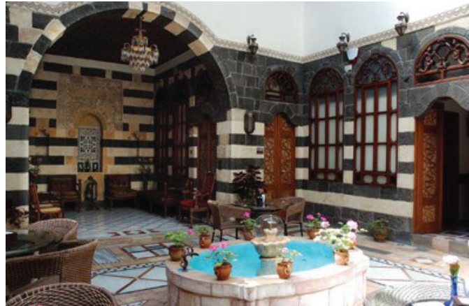
Figure 3: The alternation of light and dark stones of Old Damascus restaurants

Also in order to remain faithful to the traditional and authentic old houses Damascene, the use of marquetry furniture in some restaurants adds a certain authenticity: “marquetry furniture, yes, there is, and it can be well yes (...) for furniture like chairs or couches is authentic”.