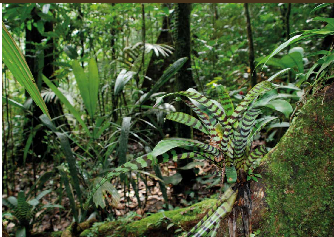
Overview of the understorey vegetation from the Guianese forest, with a specimen of the bromeliad Lutheria splendens at the base of a tree trunk. This epiphytic species can be easily recognised thanks to its zebra-striped foliage, and is typical of humid lowlands (photo B. Corbara).

First, the ecosystem being physically enclosed in the tanks of a plant, it is easy to define its boundaries and, therefore, what comes in or gets out. Moreover, since bromeliad tanks host rather simple communities, it is easy to exhaustively record the macroorganism species found in a plant. Regarding microorganisms, a single tank is however in itself a whole universe. Besides, even if they often occur in patches on a same location where they form genuine aquatic metacommunities*, bromeliads can be easily moved for experimental purposes.