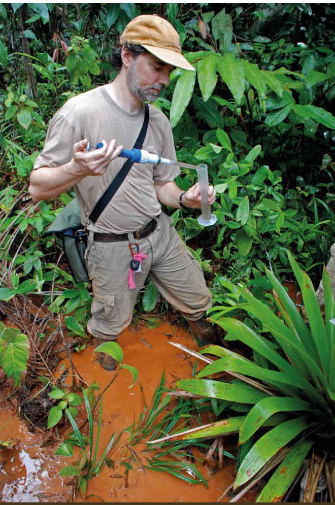
Using a pipette to remove the contents of the tanks without destroying the plant, here a Vriesea pleiosticha in French Guiana.

This paper is the english updated version of an article published in french in the magazine Espèces www.especes.org (N° 29, September-November 2018, pp. 38-47). Translation Lise Trinquand, validated by the authors and Andrew MacDonald.