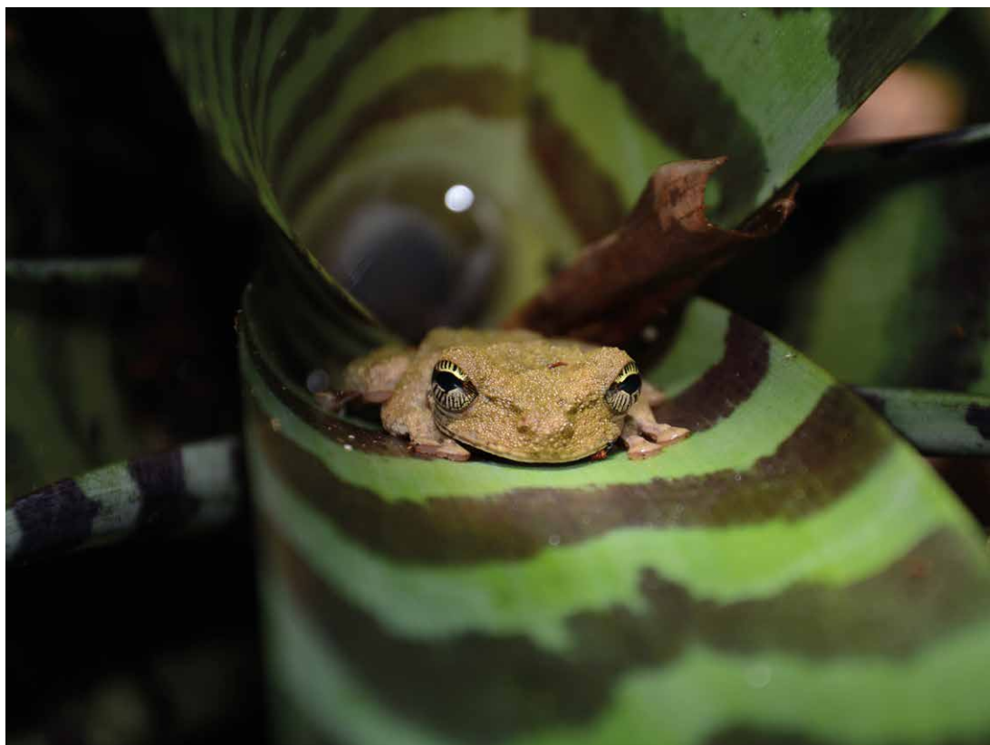
Tank bromeliads sometimes host vertebrates seeking for moist refuges or, like amphibians, spending part of their life cycle as aquatic stages. On the leaf of this Lutheria splendens from Guiana, the frog Osteocephalus oophagus , a species known to lay its eggs inside the tanks of bromeliads. The female can lay eggs in several plants that she then regularly visits to supply its tadpoles with trophic eggs.

crustaceans from the class Ostracoda ) develop slowly with less than five generations per year, filter-feeding mosquitoes such as Wyeomyia can go through 22 generations per year! With so many generations massively and continuously recruiting, bromeliad invertebrate biomass as a whole is produced in somewhat important quantities. We estimated it around 24 grams of animal dry matter per square metre of tank surface, which is comparable to what can be found in lakes and rivers worldwide. Another extrapolation, despite the uncertainty inherent to such exercises, allowed us to conclude that on one hectare at our study site, Lutheria plants annually produced 225 grams dry weight of invertebrates. It seems few, but let's not forget it is mostly tiny mosquitoes.