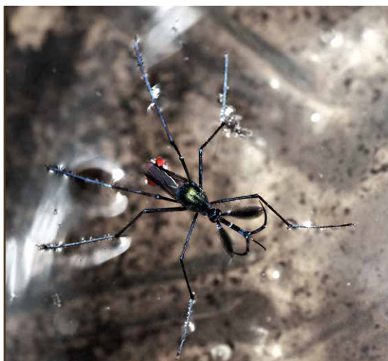
Like other mosquitoes, Toxorhynchites have aquatic larvae and terrestrial adults. However, whilst most mosquito larvae are filter-feeders, Toxorhynchites larvae are top predators. The adult is a large, non-biting mosquito, which feeds on nectar. Here, an adult male Toxorhynchites haemorrhoidalis from French Guiana (photo C. Bonhomme).

crustaceans from the class Ostracoda ) develop slowly with less than five generations per year, filter-feeding mosquitoes such as Wyeomyia can go through 22 generations per year! With so many generations massively and continuously recruiting, bromeliad invertebrate biomass as a whole is produced in somewhat important quantities. We estimated it around 24 grams of animal dry matter per square metre of tank surface, which is comparable to what can be found in lakes and rivers worldwide. Another extrapolation, despite the uncertainty inherent to such exercises, allowed us to conclude that on one hectare at our study site, Lutheria plants annually produced 225 grams dry weight of invertebrates. It seems few, but let's not forget it is mostly tiny mosquitoes.