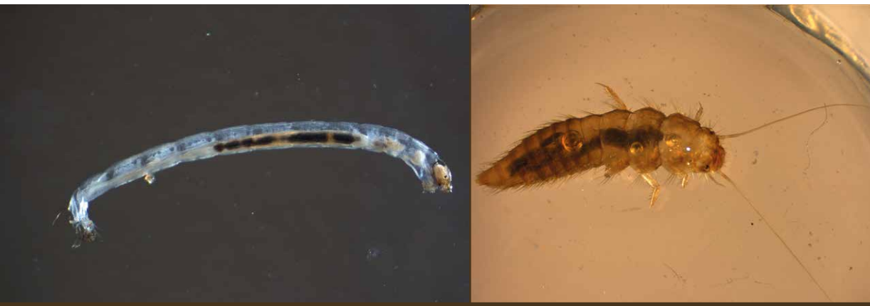
Two detritivorous organisms from the tanks : a Chironomidae larva (Diptera) on the left, and a Contacyphon larva (Scirtidae beetle) opposite.

Detritivorous macroorganisms* also contribute to litter breakdown, from coarse to finer elements that accumulate at the bottom of the tanks. These detritivores (mostly larvae of terrestrial adult insects) can be divided into shredders such as Tipulidae, and scrapers such as Scirtidae (beetles feeding on large algae attached at the surface of the litter). Collectors such as Chironomidae feed on fine deposited organic matter, and filter-feeders such as mosquito larvae sift fine particles from the water column. All of these inhabitants produce fecal pellets that further feed microorganisms and, once they decompose and mineralise, provide nutrients that the plant partly retrieves through specialised trichomes*.