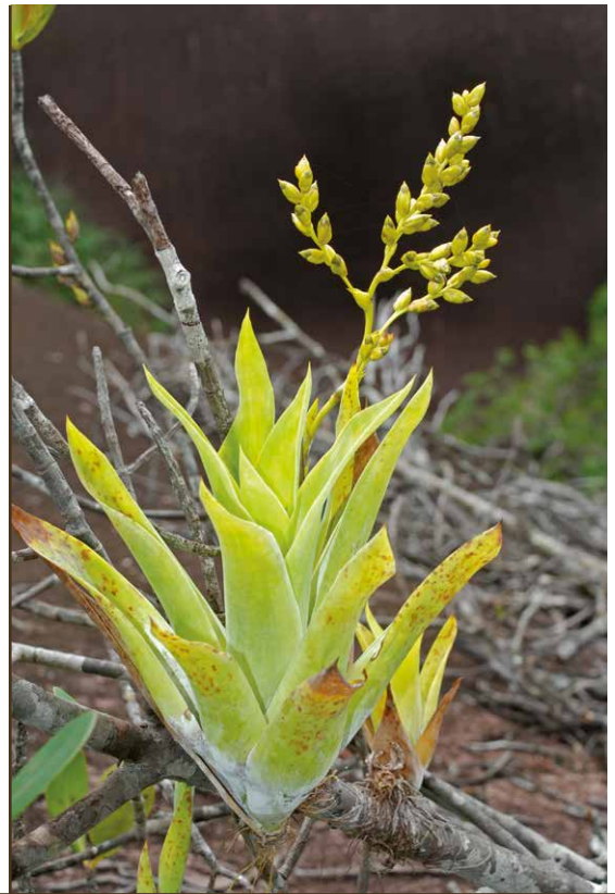
On the Nouragues inselberg in French Guiana, the bromeliads Aechmea melinonii (opposite) and Catopsis berterionana (top right), which sometimes grow only a few metres away from each other, host very different algal communities in their tanks.

Until recently, there was no information on temporal changes in aquatic communities in terms of species turn-over or biomass production. Only “snapshots” were available (recorded only occasionally, at different times of the year). We felt that such knowledge, available for decades for much