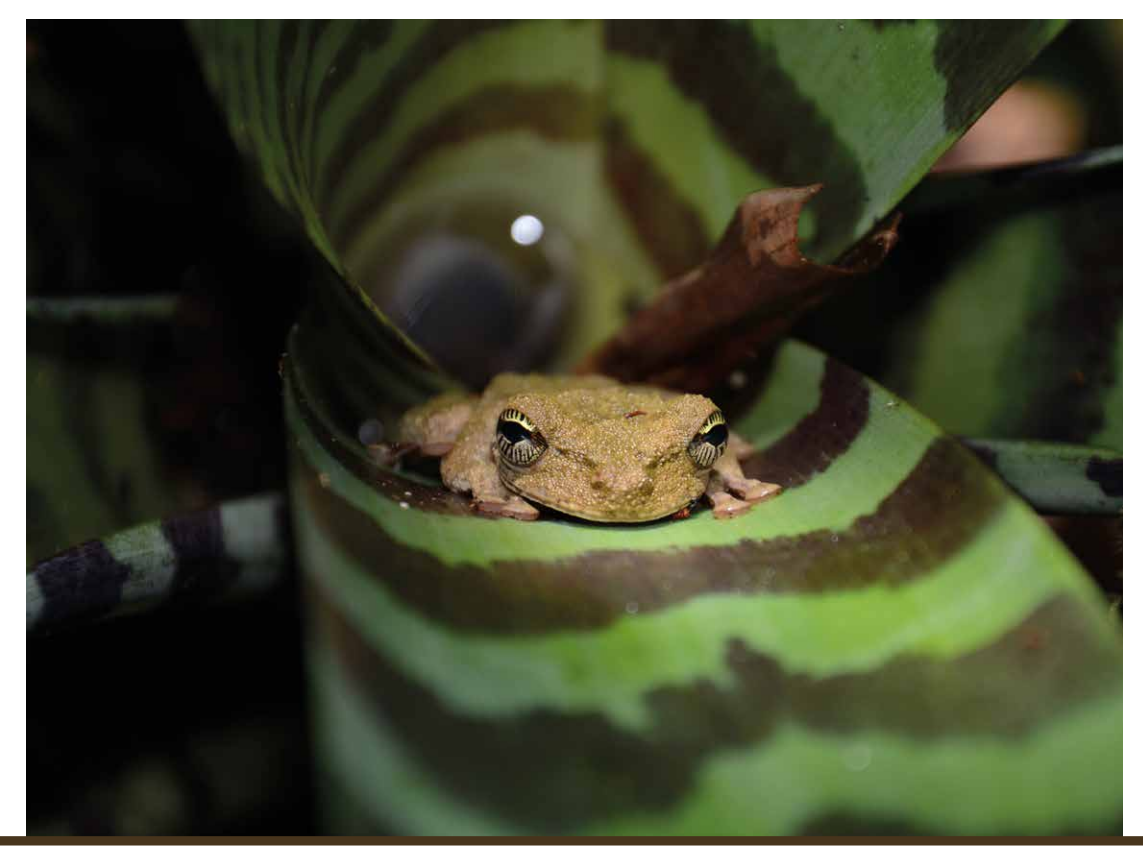
Tank bromeliads sometimes host vertebrates seeking for moist refuges or, like amphibians, spending part of their life cycle as aquatic stages. On the leaf of this Lutheria splendens from Guiana, the frog Osteocephalus oophagus , a species known to lay its eggs inside the tanks of bromeliads. The female can lay eggs in several plants that she then regularly visits to supply its tapdpoles with trophic eggs.

crustaceans from the class Ostracoda) develop slowly with less than five generations per year, filter-feeding mosquitoes such as Wyeomyia can go through 22 generations per year! With so many generations massively and continuously recruiting, bromeliad invertebrate biomass as a whole is produced in somewhat important quantities. We estimated it around 24 grams of animal dry matter per square metre of tank surface, which is comparable to what can be found in lakes and rivers worldwide. Another extrapolation, despite the uncertainty inherent to such exercises, allowed us to conclude that on one hectare at our study site, Lutheria plants annually produced 225 grams dry weight of invertebrates. It seems few, but let's not forget it is mostly tiny mosquitoes.