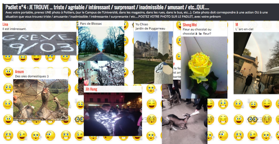
Figure 2: Pictures uploaded on the platform

Each learner expressed the feelings experienced by looking at the photos and justified their feelings by explaining them.