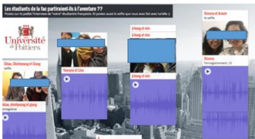
Figure 1: Oral production on the uploaded on the platform

2. learners uploaded their productions on the platform. The whole assignment (interview and selfie) was posted on a Padlet wall reserved for this activity, which allowed all the groups to share and to check the videos.