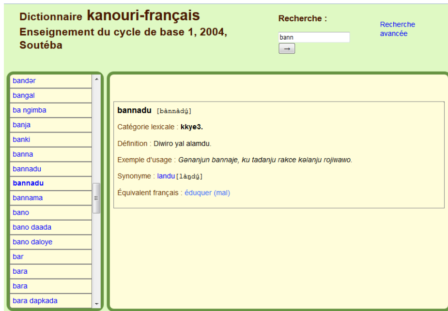
Figure 4: The entry "bannadu" on the DiLAF website