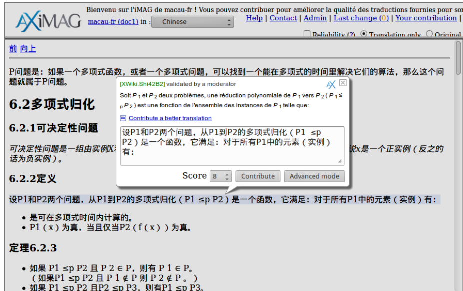
Fig. 1. The post-editing bubble on a segment

Contrary to Google Translate, an iMAG is dedicated to an elected Web site, or rather to the elected sublanguage defined by one or more URLs and their textual content. It contains a dedicated translation memory (TM). Segments are pretranslated not by a unique MT system, but by a (selectable) set of MT systems. Systran and Google Translate are mainly used now, but specialized systems developed from the post-edited part of the TM have also been used, notably for French→Chinese.