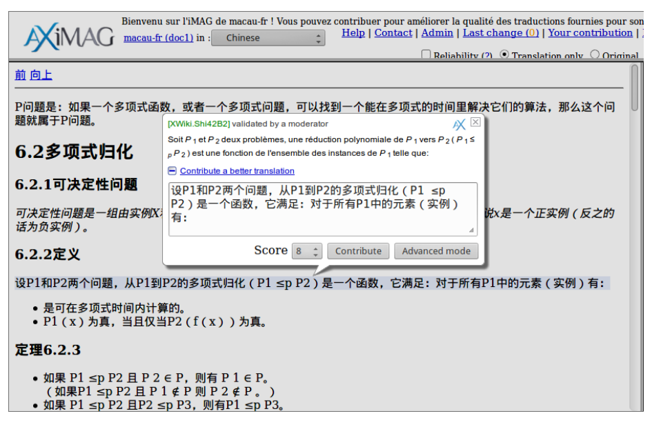
Fig. 1. The post-editing bubble on a segment

Contrary to Google Translate, an iMAG is dedicated to an elected Web site, or rather to the elected sublanguage defined by one or more URLs and their textual content. It contains a dedicated translation memory (TM). Segments are pretranslated not by a unique MT system, but by a (selectable) set of MT systems. Systran and Google Translate are mainly used now, but specialized systems developed from the post-edited part of the TM have also been used, notably for French—Chinese.