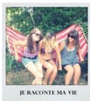
DANS MA VALISE, CET ÉTÉ

The blog containing disclosures of private life had the following characteristics: scene-setting (blogger shown with products), confidences on her private life