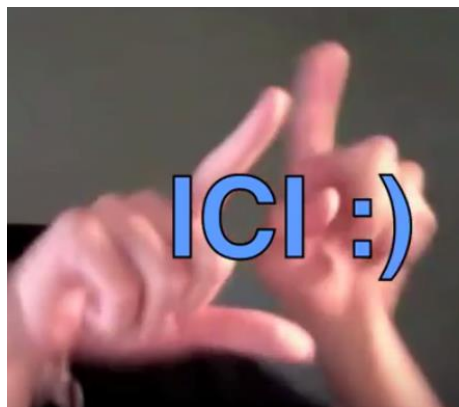
Figure 2.3 Clickable word with a smiley

In his first video, "Coucou," Michael points with his fingers to a superimposed clickable word ( ici [here]) and a smiley, which is a link to subscribe to his channel (Figure 2.3). With this icon, he shows users how to subscribe to his channel in an animated way that reflects not only his mastery of the technical interface but also the discursive aspects of this type of technolanguage.