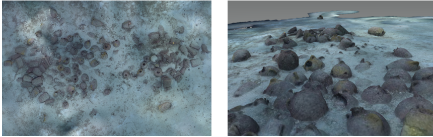
Fig. 1. Example of obtained models for the underwater site Xlendi. An Overall orthophoto (left) and a close-up view of the generated 3D model (right)

synchronized and controlled by a computer. All three cameras are mounted on a bar located on the submarine just in front of the pilot. Continuous lighting of the seabed is provided by a Hydrargyrum medium-arc iodide lamp (HMI) powered by the submarine. The continuous light is more convenient for both the pilot and the archaeologist who can better observe the site from the submarine. The high frequency acquisition frame rate of the cameras ensures full coverage whereas the large scale of acquired images gives the eventual 3D models extreme precision (up to 0.005 mm/pixel for the orthophoto). Briefly, the deployed procedure consists of three phases, the first two are done in real-time while the third is achieved in a later step. Starting with image orientation phase, it is possible to know the exact pose of the camera at each image acquisition. On the other hand, contrary to PMVS, our developments directly use the images produced by the cameras, without any distortion correction nor rectification. We refer to [5] for more details, see Figure1. Deployed in this way, the acquisition system entails zero contact with the archaeological site making it both non-destructive and extremely accurate.