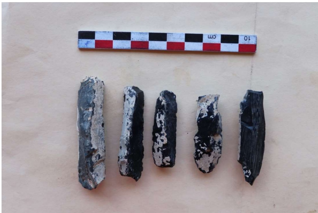
Fig. 7. Blades from WB1 #1001