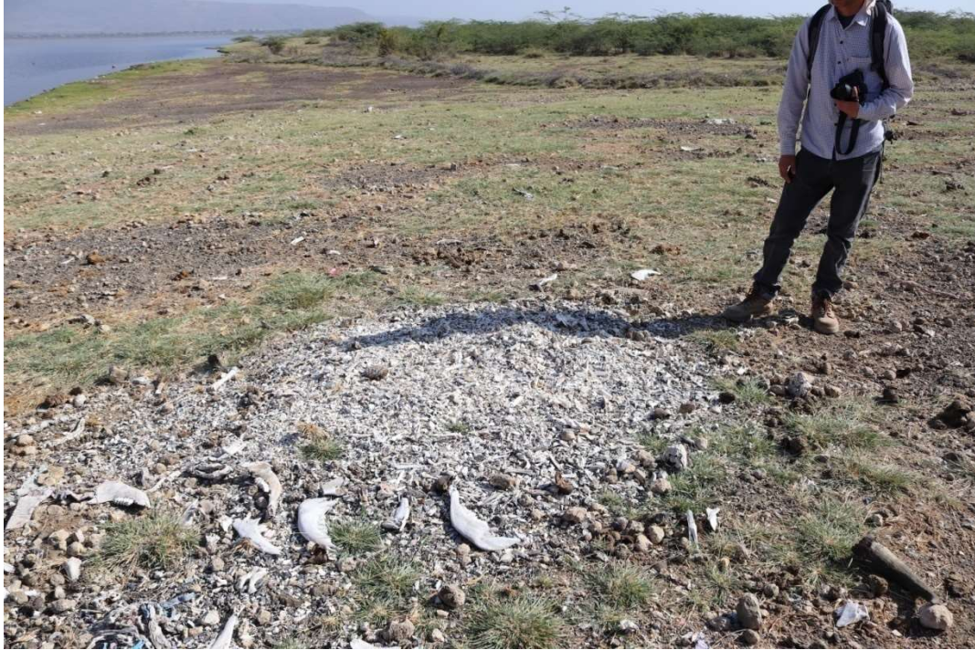
Fig.14. Modern animal carcasses being accumulated, perhaps by dogs