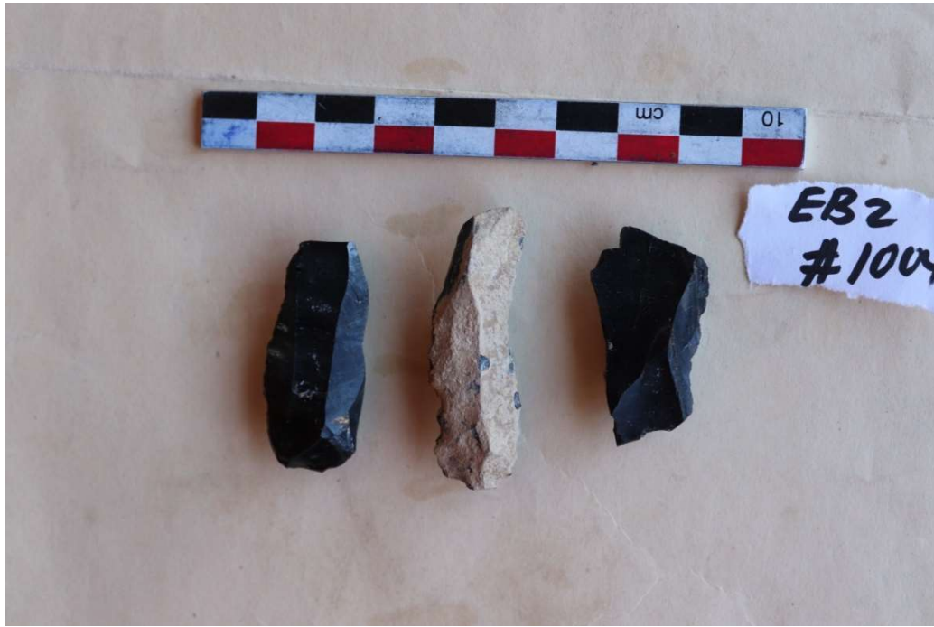
Fig.10 Blade from EB2 site (#1004)