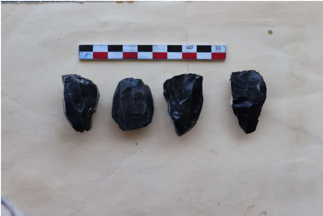
Fig. 6 Cores from WB1 surface #1001