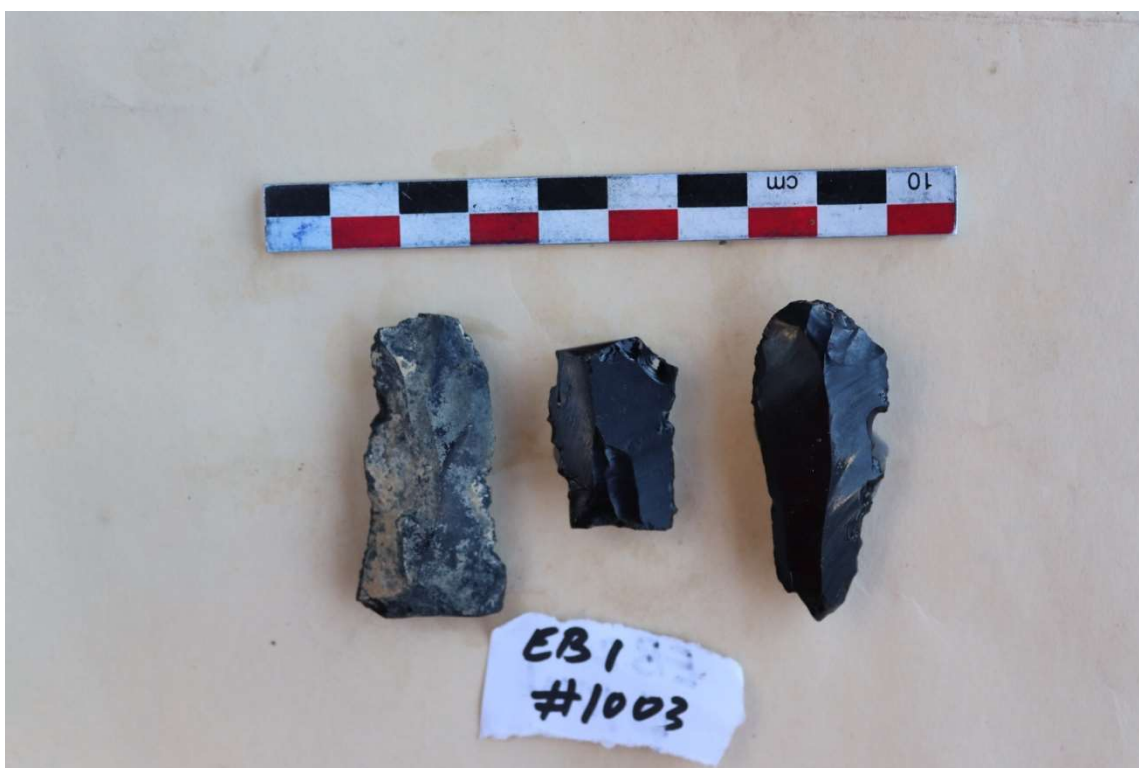
Fig.9 Blade and cores from #1003 EB1 site