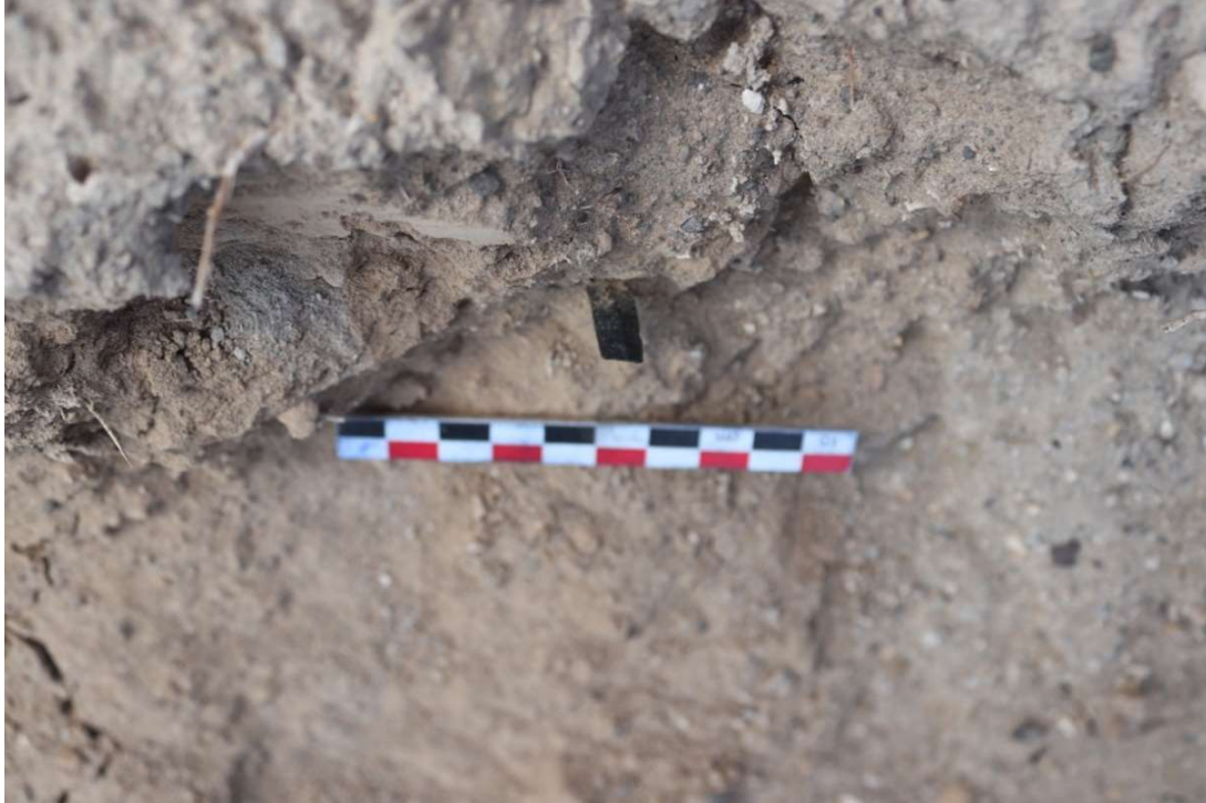
Fig.16. obsidian artifact in the section of AB1 site