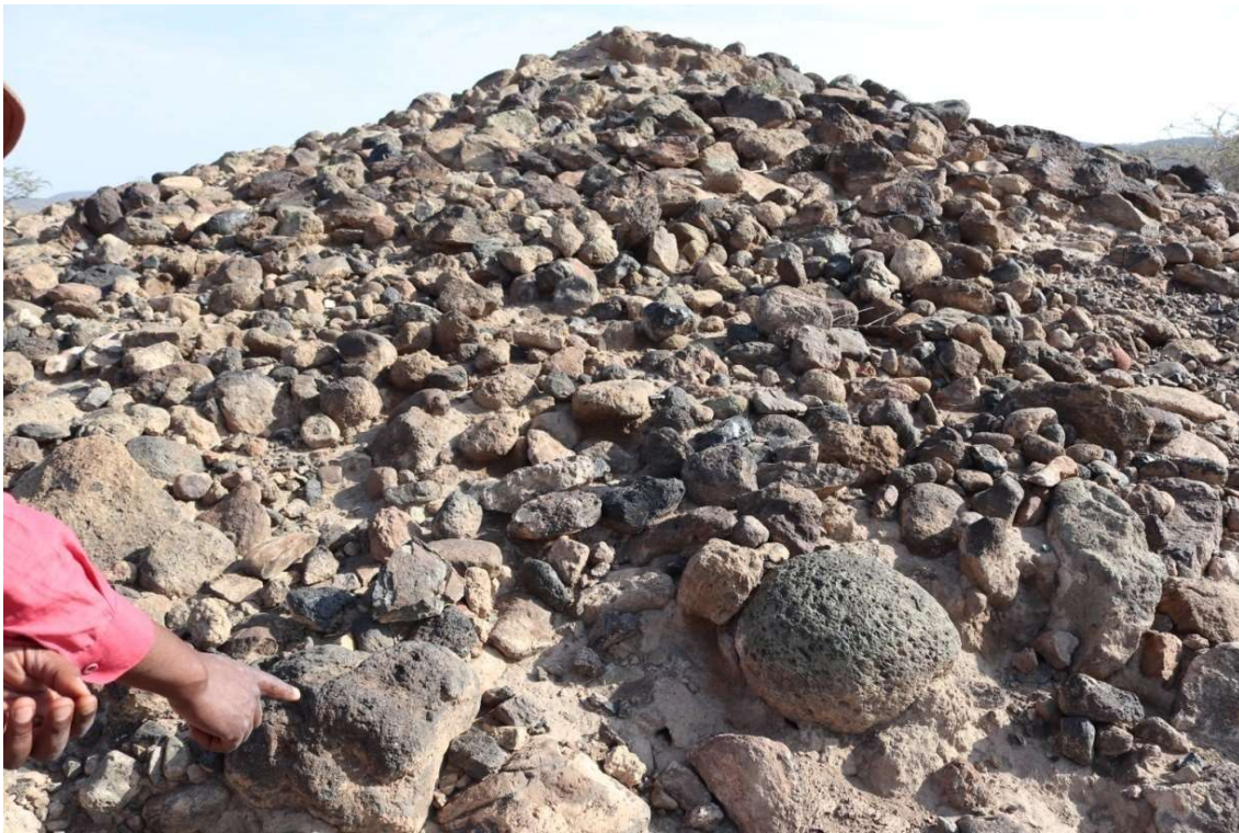
Fig.17. the close-up views of the Fentale tumulus (?).