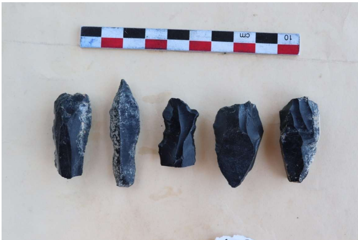
Fig.8 Blade and cores from #1002 WB2 area