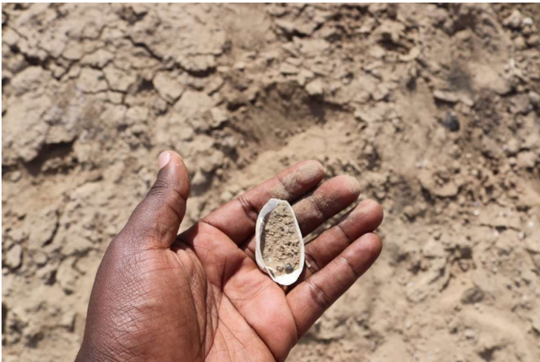
Fig.15. gastropode shells eroded out of the Awash-Beseka (AB1) site.