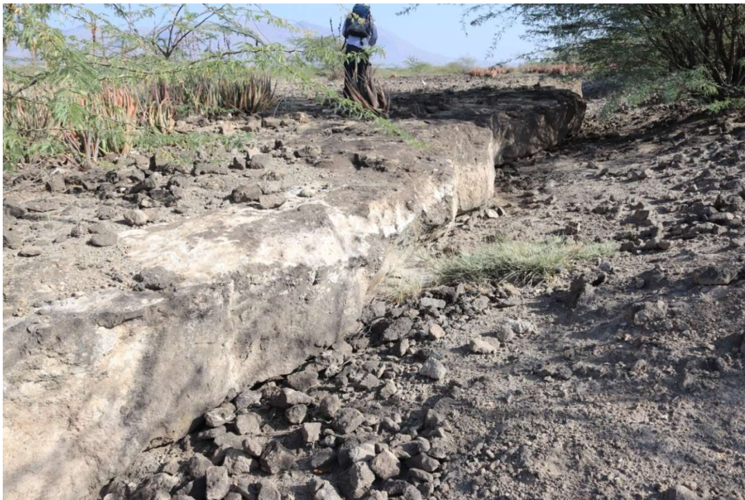
Fig.13 Tephra section exposed around the eastern Beseka sites.