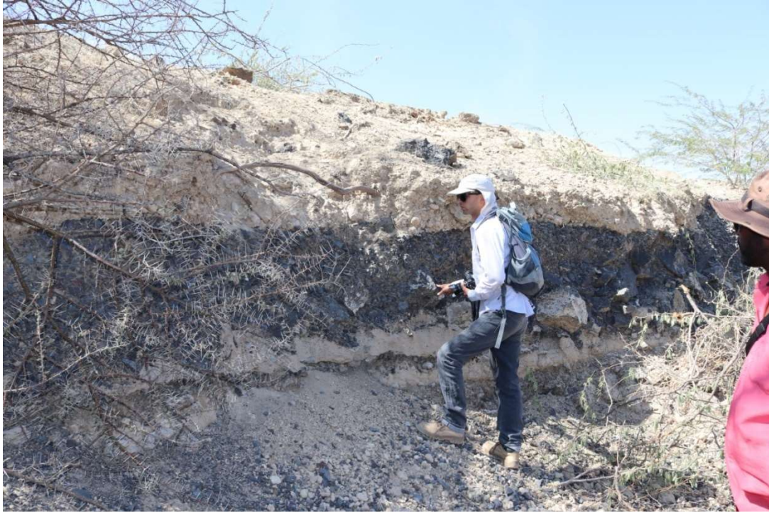
Fig.12 The profile of WB2 area opened by excavator machine (CM pictured looking the section)