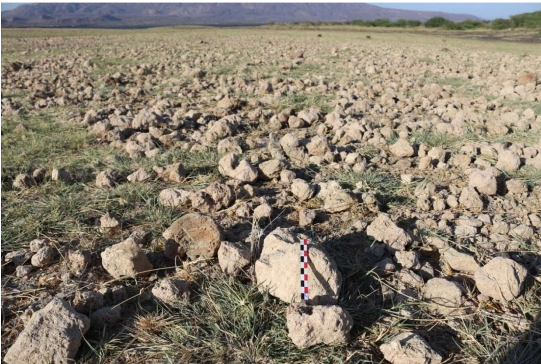
Fig.2 pumice fragments in EB1 site

Here, we locate three surfaces lithic scatter areas what we name Eastern Beseka 1, 2 and 3 sites (EB1, EB2 and EB3 sites).