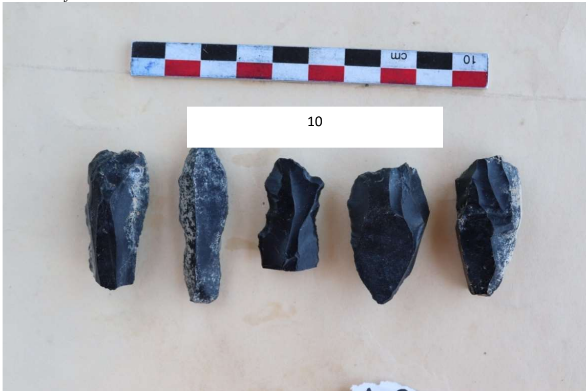
Fig.8 Blade and cores from #1002 WB2 area