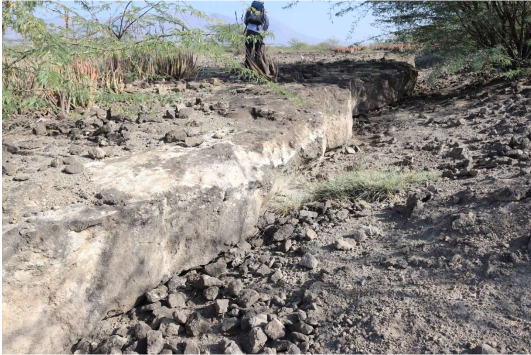
Fig.13 Tephra section exposed around the eastern Beseka sites.