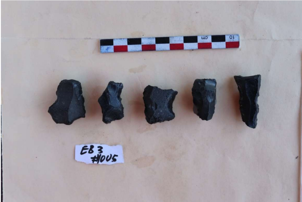
Fig.11 Scrapers and Notches from EB3 site (#1005)