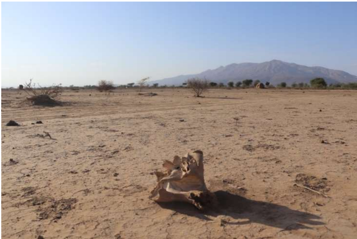
Fig.4 Metehara Flood Plain

In around 5 km east of Metahara town, we explored the flood plain area located further north of Awash River. We went this area following the information we got from Google satellite images which showed the deposition of sediments in quite large area. As we reached there, it turned out that the sediments seem to be largely modern one perhaps created by perennial flood events (Fig.4). Here, we observed very few artifacts, certainly transported by the running water. Attempts to find sedimentary section to see the profile of the flood plain was not successful, partly because it is quite a large area to reach out all in limited time.