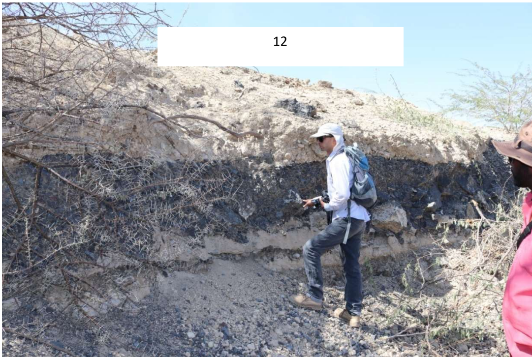
Fig.12 The profile of WB2 area opened by excavator machine (CM pictured looking the section)