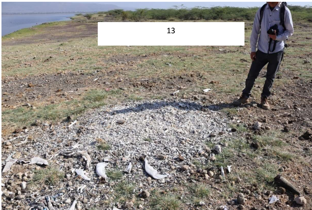
Fig.14. Modern animal carcasses being accumulated, perhaps by dogs