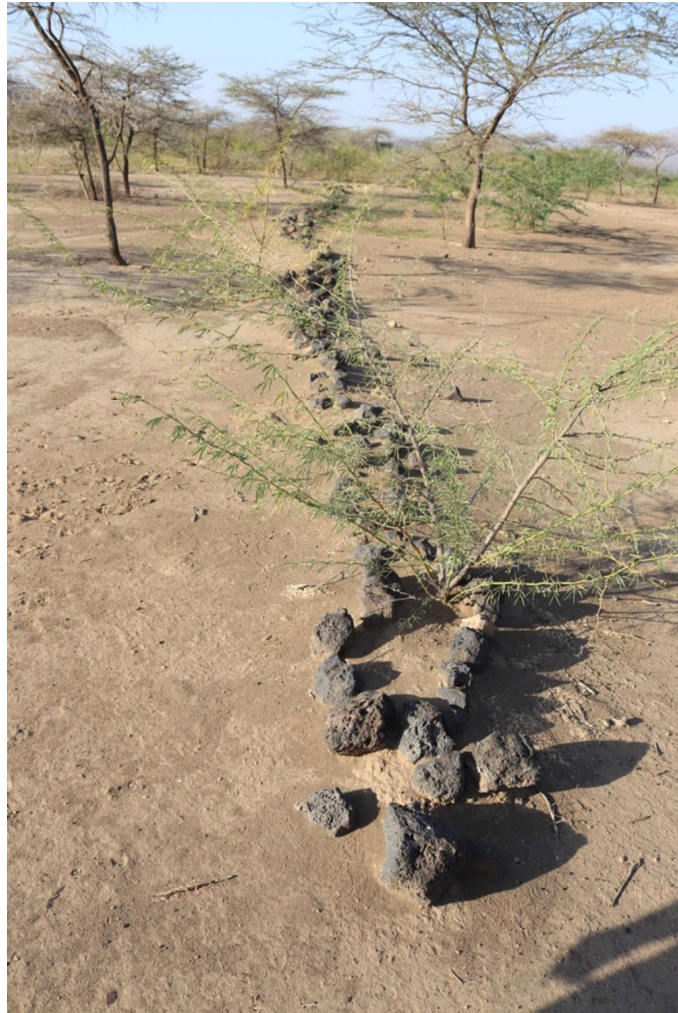
Fig.20. A row of basalt blocks being erected around Western Beseka sites (we do not know why it is built).