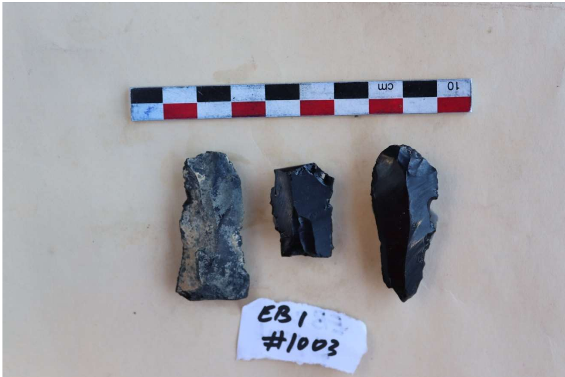
Fig.9 Blade and cores from #1003 EB1 site