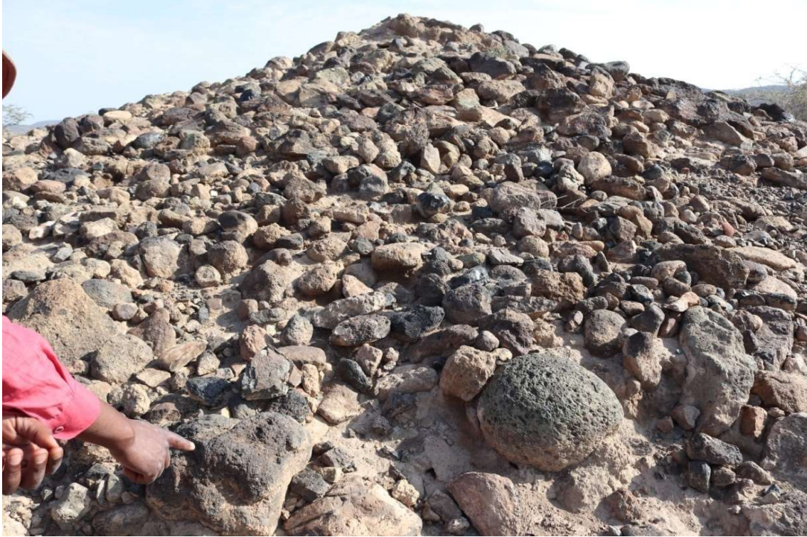
Fig.17. the close-up views of the Fentale tumulus (?).