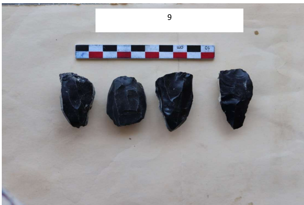
Fig. 6 Cores from WB1 surface #1001