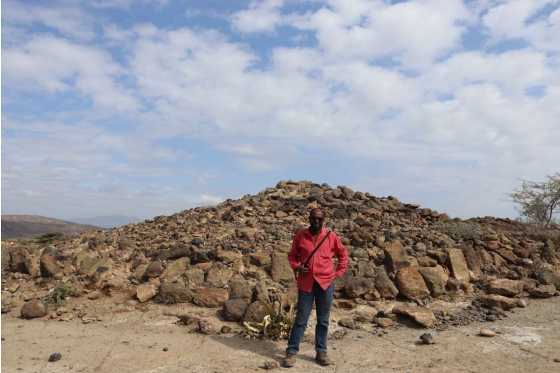
Fig.5 Fentale Tumulus (?)

Here, we learnt that the ridges are basaltic lava in origin, in most cases, has reddish-brown and deep black colors. Indeed, a larger part of the ridges has rather reddish-brown basaltic rock than black one. In the area we name Fentale site (Fs1) [GPS Coordinate: N 09.01561°/ E 039.85225°], we observe few lithic artifacts, scattered on sediments whose origin is not clear, and many of the samples are side scrapers (Fig.19).