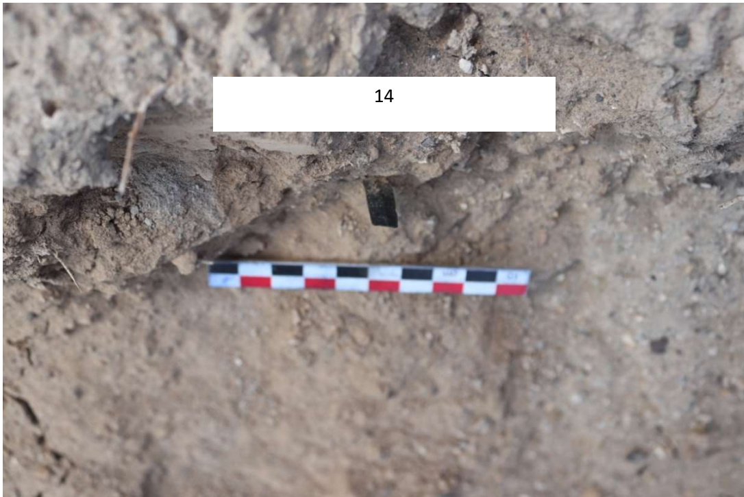
Fig.16. obsidian artifact in the section of AB1 site