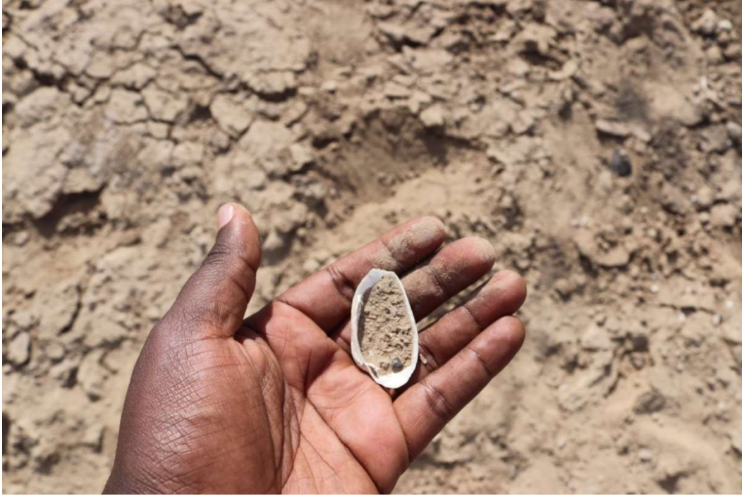
Fig.15. gastropode shells eroded out of the Awash-Beseka (AB1) site.