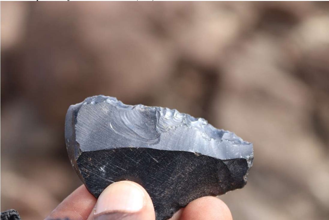
Fig.19. lithic scraper from Fs1 site