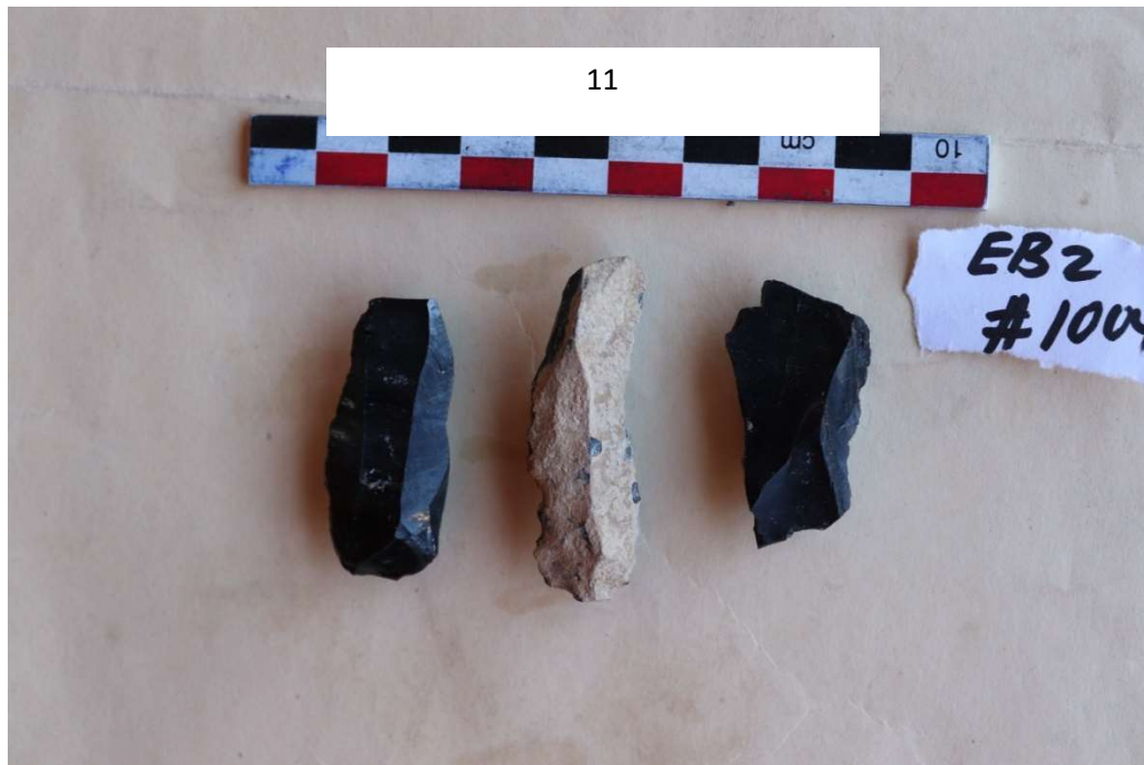
Fig.10 Blade from EB2 site (#1004)