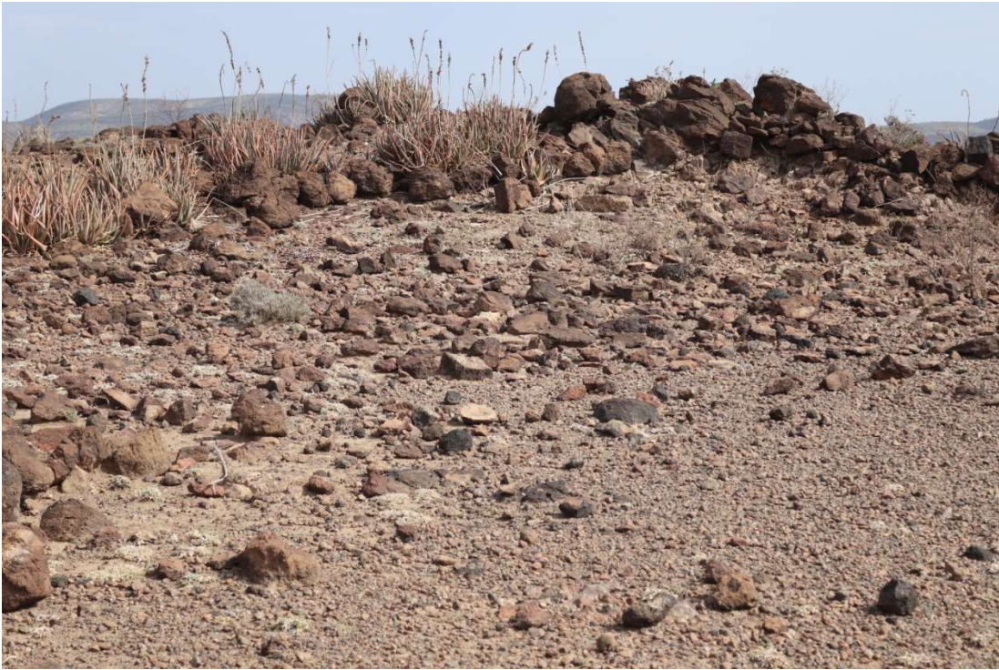
Fig.18. Close-up view of the Fentale site (Fs1)