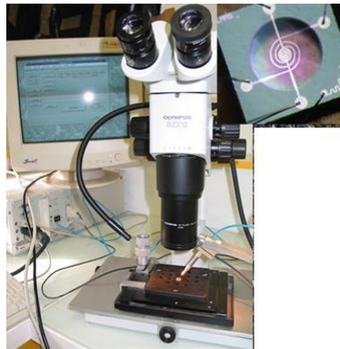
Figure 2: Semi-manual ink-jet method and silicon platform before sensitive layer deposition