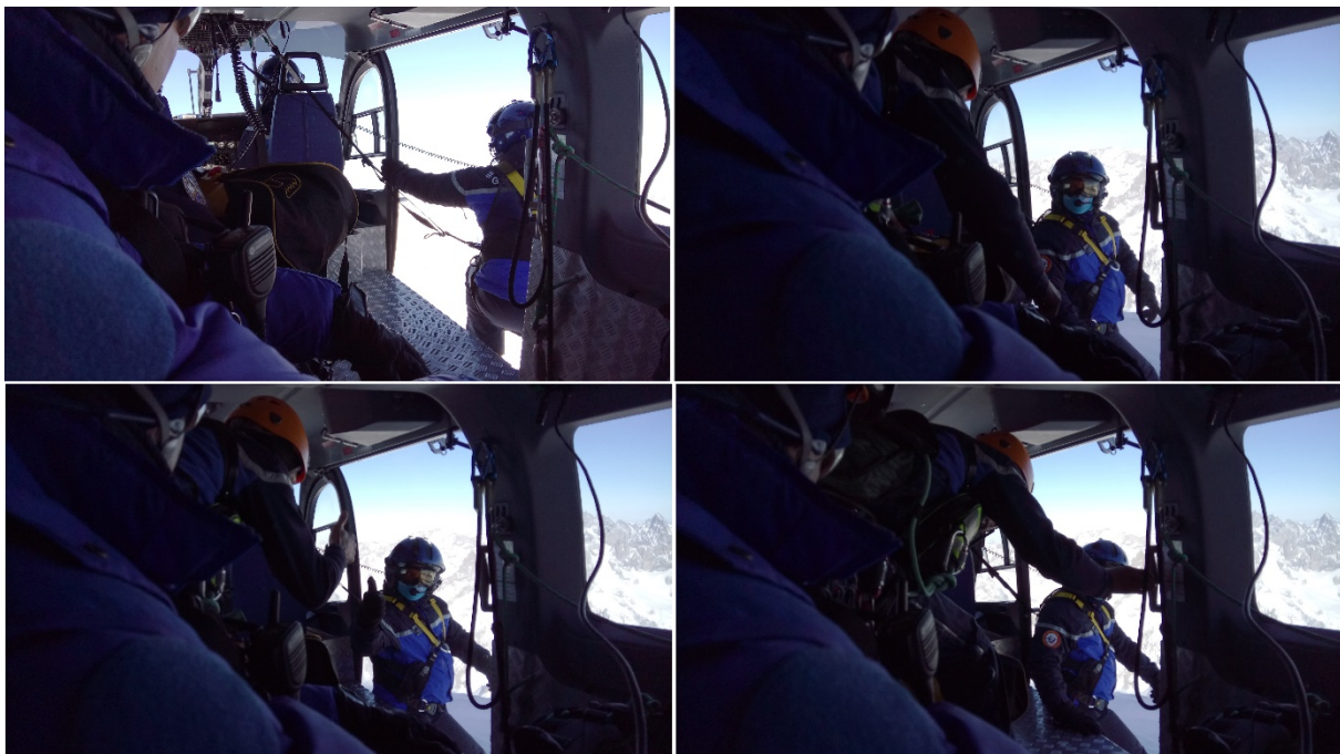
Figure 1. Example non-verbal code when disembarking

The dialogue between the pilot and the flight engineer is continuous and it does not interrupt until the disembarking of the rescuers and the physician: