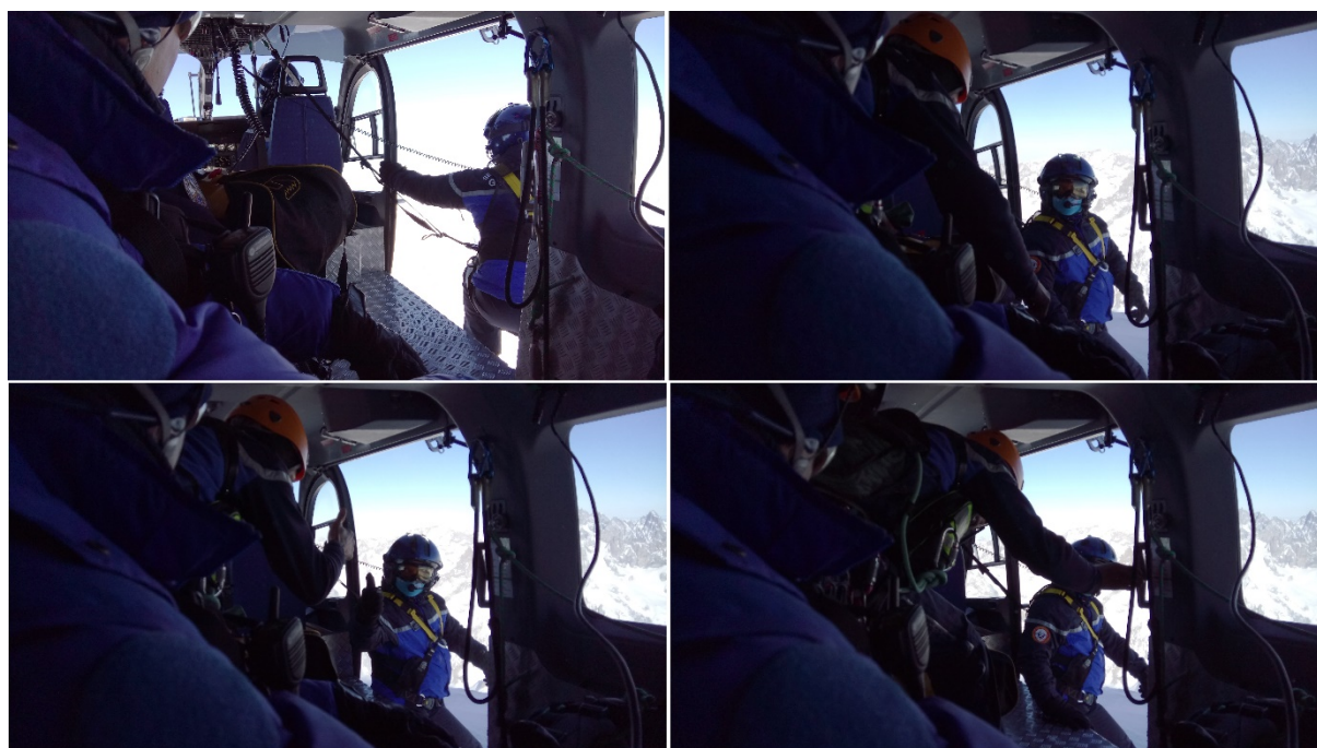
Figure 1. Example non-verbal code when disembarking

The dialogue between the pilot and the flight engineer is continuous and it does not interrupt until the disembarking of the rescuers and the physician: