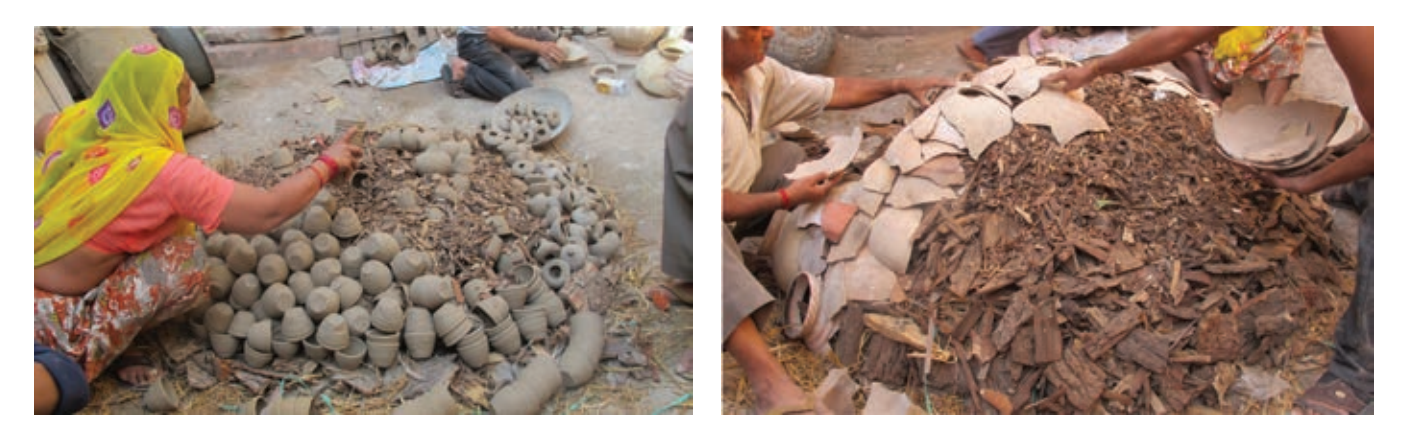
Figure 7. Open firing in Jodhpur city, 2014.

depression and a central hearth (Figure 6). Cow dung and wood chips form the fuel bed on which the vessels are arranged. The first vessels are disposed in the center so as to form a chimney. Then all of the vessels are arranged concentrically around this central chimney. They are covered with cow dung. The firing is started through the central chimney with a piece of burning cow dung. Lastly, the whole load—which can be up to 800 vessels—is covered successively with straw and wet clay for containing the heat. The firing lasts around 12 h followed by 12 h cooling.