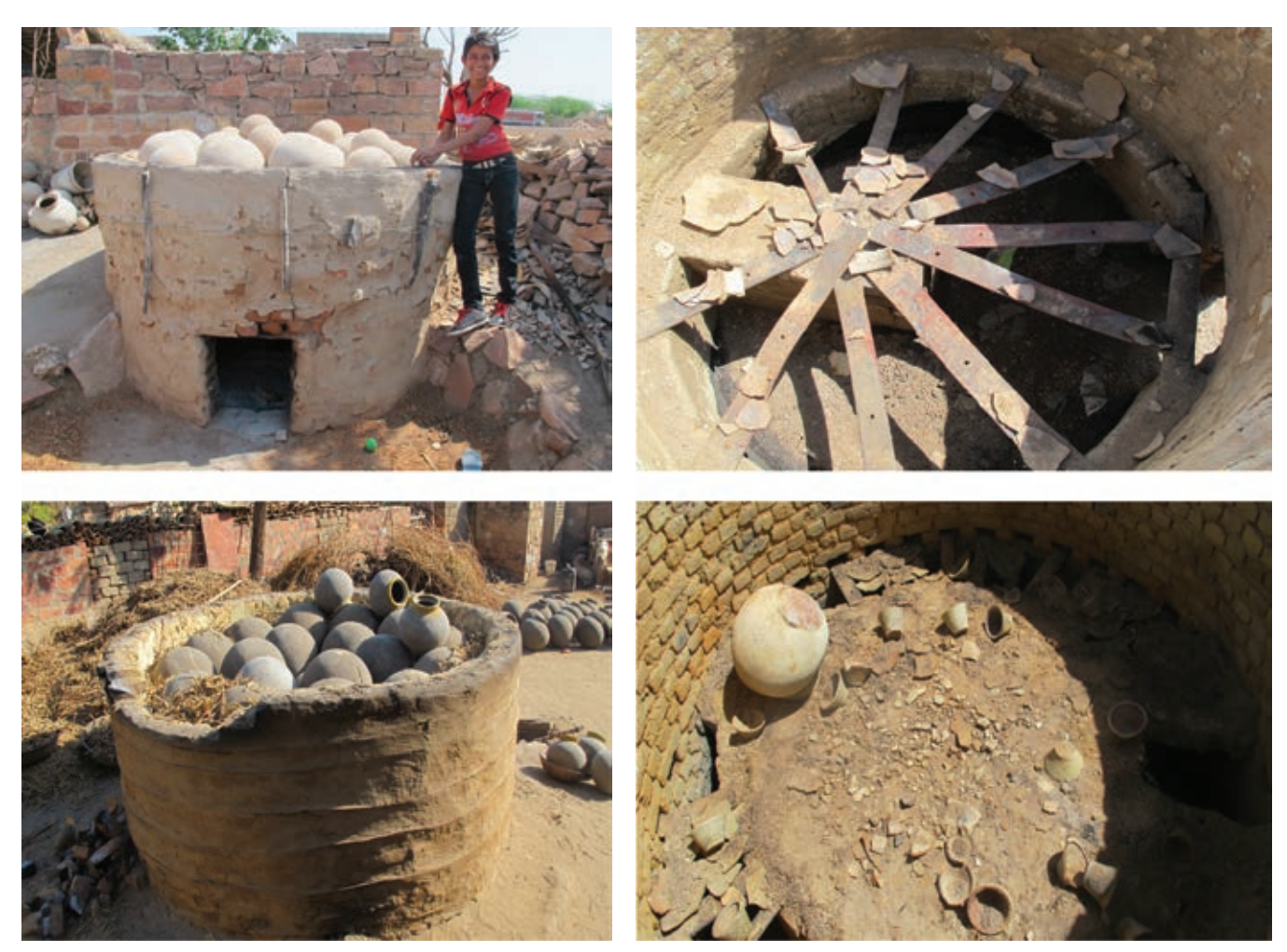
Figure 4. Kilns found in the Jodhpur district (top) and in the Barmer district (Pachpadra, below), 2014.

clay. In contrast, the floor separating the two chambers is made of metallic blades resting both against the wall and a central rectangular pillar leaning against the circular wall (Figure 4, top). The combustion chamber is partly buried in the soil with a square mouth. This type of kiln originates from Gujarat. The capacity of the Gujarati kiln is small: 50 jars of 30 liters.