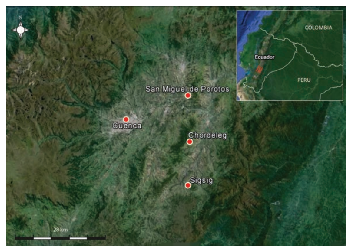
Figure 2. Location of the surveyed villages in Ecuador.