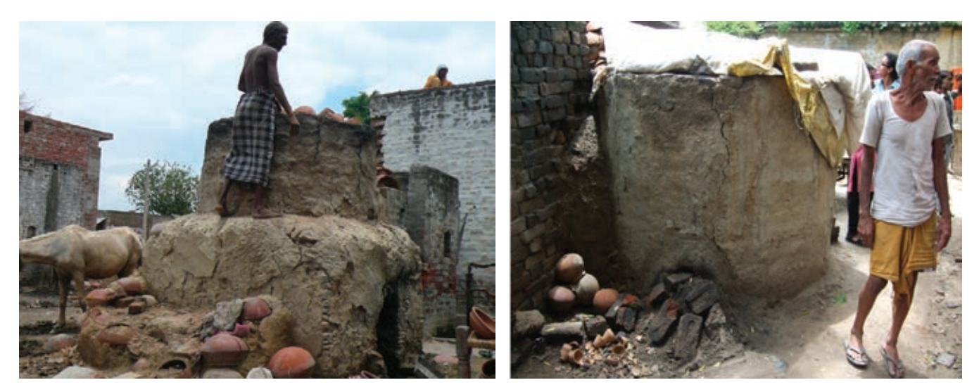
Figure 3. Multani kiln (left) and Prajapati kiln (right) in the Bulandshar district, 2011.

clay-perforated sole as described by Rye and Evans (Rye and Evans 1976) (Figure 3, left). The one made by the Hindu potters does not present a square foundation but is built according to the same principles (Figure 3, right). Kilns have different capacities depending on their size.