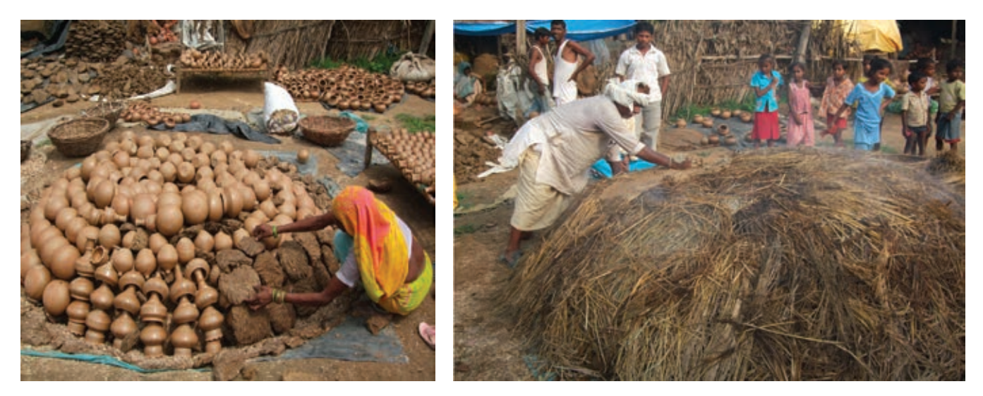
Figure 6. Open firing in the Bulandshar district, 2011 (© V. Roux).

In the Bulandshar region the potters traditionally fire their vessels in open firings with a shallow circular