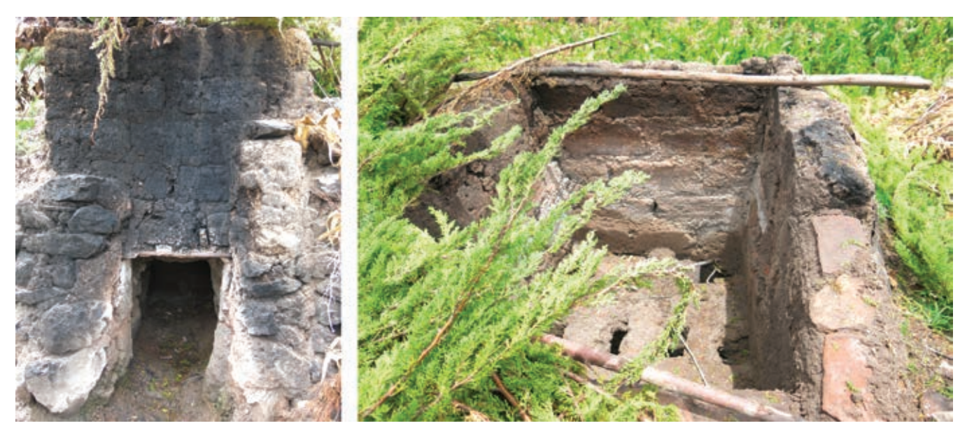
Figure 5. Kiln in Chico Ingapirca.

Another type of kiln is also found in the Jodhpur region. It originates from Jaipur and is used at Pachapdra only (Figure 1). Unlike the Gujarati kiln, the metallic blades of the floor separating the two chambers rest on a large central circular pillar (Figure 4, below). The result is a larger heating chamber containing up to 120 jars and a floor with small peripheral holes. The advantage is that the vessels are less in contact with the fire than in the Gujarati kiln.