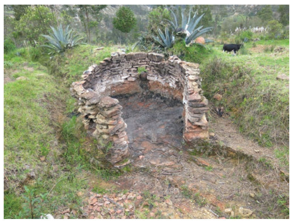
Figure 9. Walled firing in San Juan Bosco, 2014.