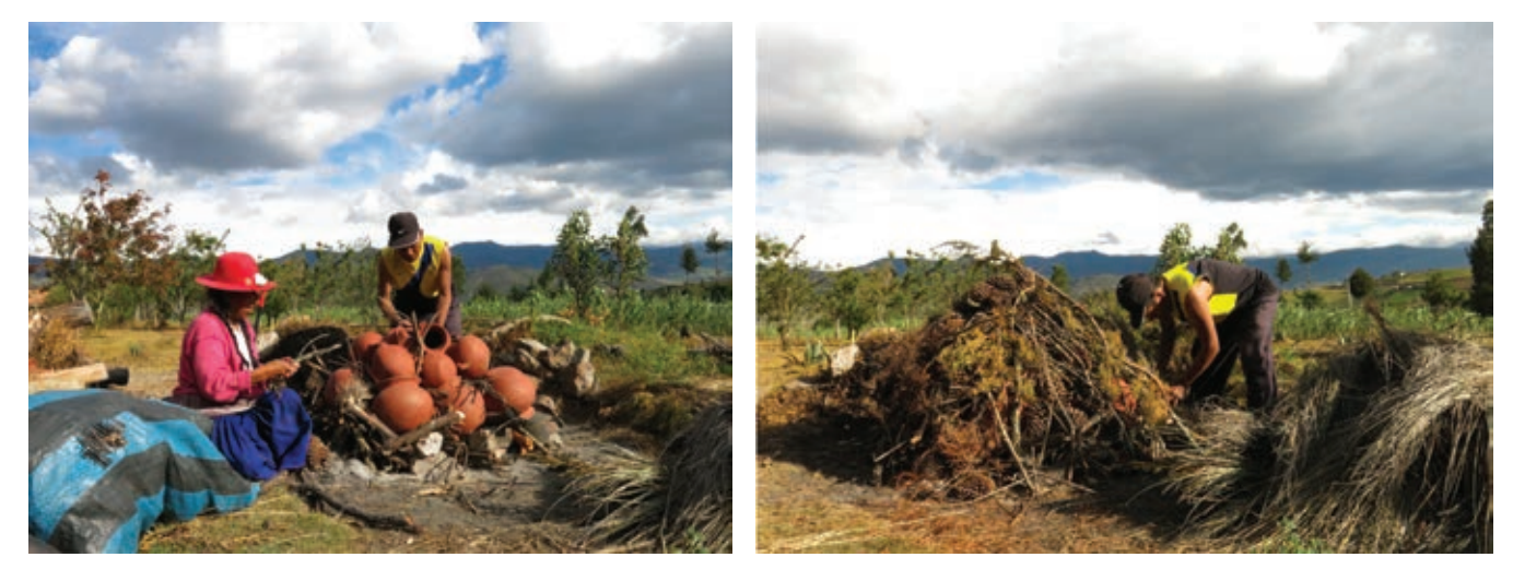
Figure 10. Open firing in Sigsig, 2014.