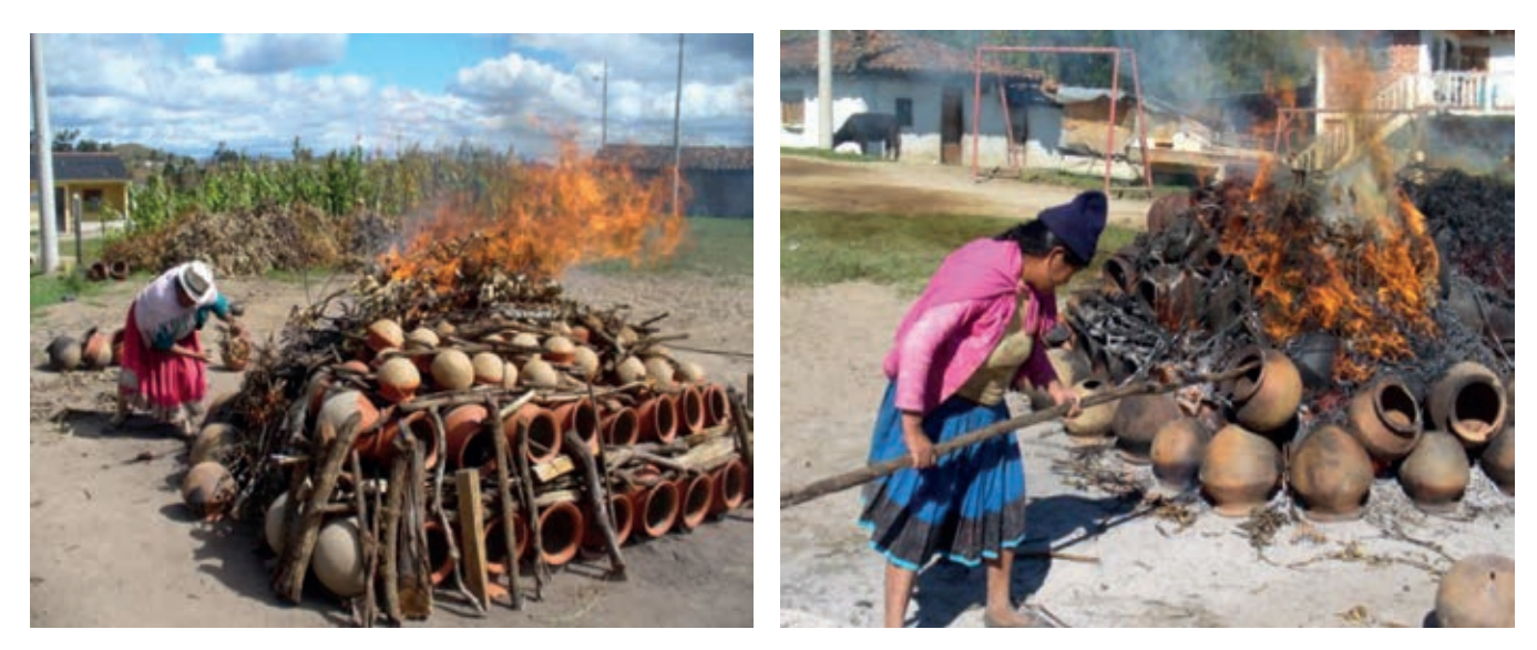
Figure 8. Open firing in Pacchapamba, 2011.

In the walled firing, the enclosure consists of a wall in the shape of a horseshoe (or three walls forming an open square) (Figure 9, next page). This 1 m high wall is made up of stone blocks. The arrangement of the vessels and the wood is the same as for open firing (including the layer of shards underneath the first row of vessels). The final load is covered with straw. Two hundred vessels are fired at a time in walled firing. The firing lasts around 2 h.