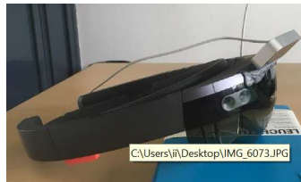
Figure 1. LMC attached on the top of HoloLens

In this work, we first investigated how to combine the two devices to get them working together in real time, and then we evaluated the proposed 3D hand interactions.