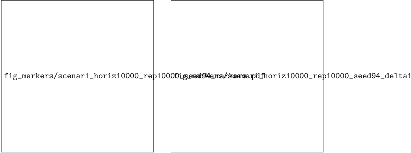
Figure 3: Regret of various algorithms as a function of time in the Poisson scenario. The right hand-side plot only displays the best performing policies on a harder problem.