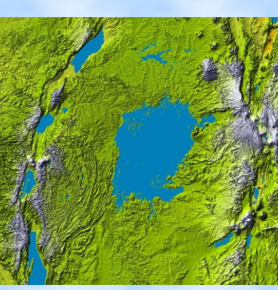
Fig 2. Lake Victoria and Fig 3. Relief 3-D image of Lake Victoria surrounding countries. Graphic: Eric Daigh/Circle of Blue.