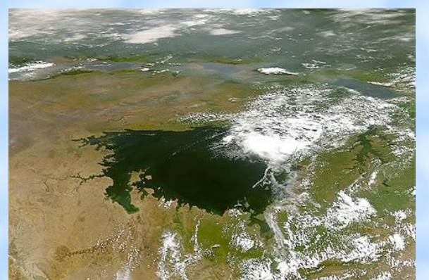
Fig 1. Image of Lake Victoria.