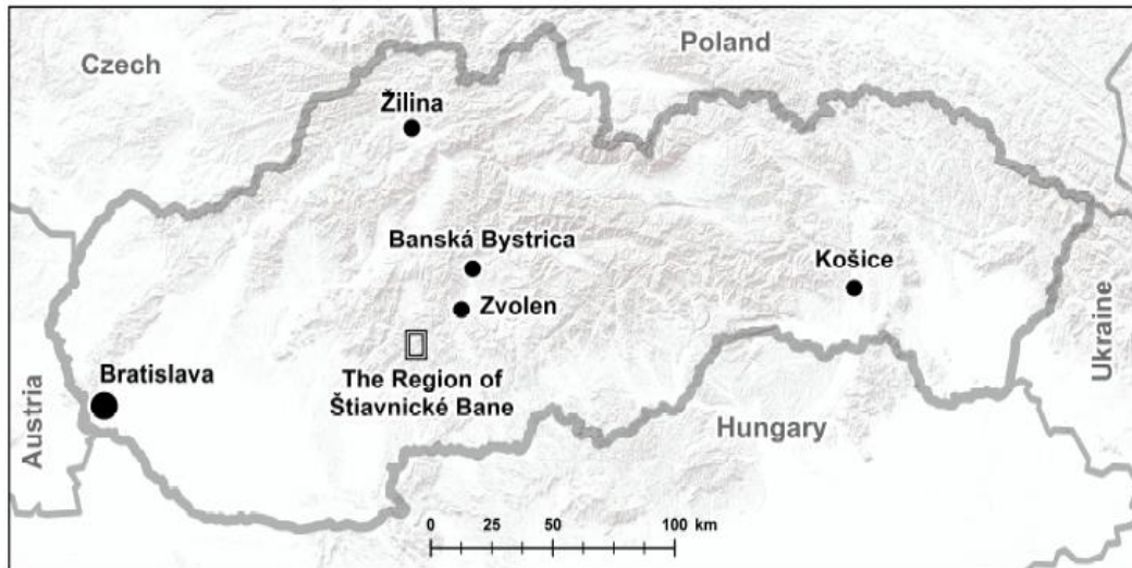
Figure 1. The Localization the Region of Štiavnické Bane (study area).

The target aim for the landscape protection is balanced relationship between the land cover types and land use types, which is affected by a massive “tourism attack” on landscapes since the last three decades, as reported by (Králik, 2001).