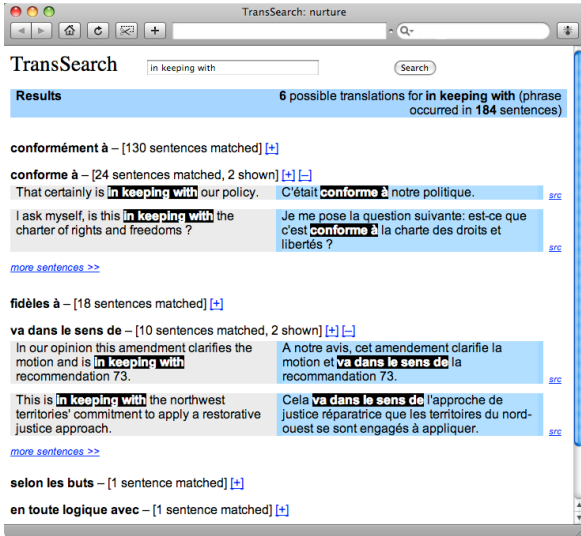
Figure 2: A hypothetical interface which exploits translation spotting.

identified. Of course, she can still consult the pairs of sentences containing the query, but can as well click a given translation to see related matches.