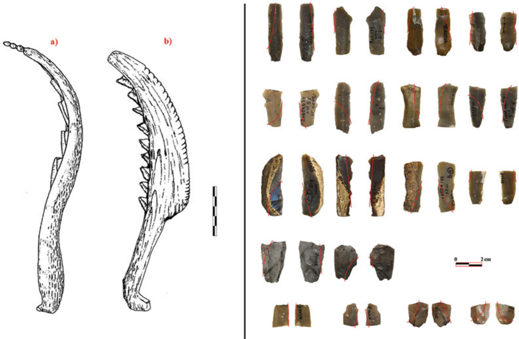
Figure 2. Examples of glossy blades for bended sickles, with: a) antler sickle from Karanovo (modified from Gurova 2014); b) wooden sickle from La Marmotta (modified from Pessina & Tiné 2008).