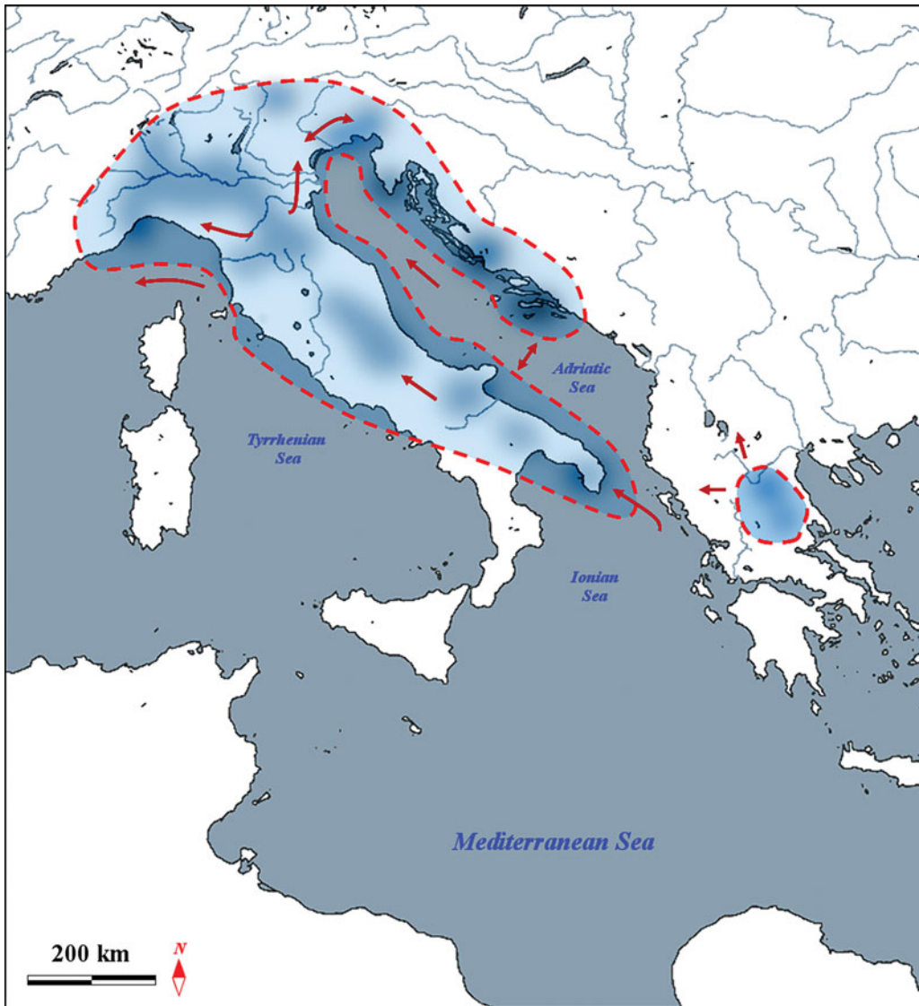
Figure 1. Geographic framework. Red dotted lines mark the area of the study. Red arrows indicate the main routes of diffusion acknowledged today. Darker blue shades indicate the areas with a major concentration of analysed sites.

terms of the technologies of sickle and reaping-knife production, and in terms of the types of agricultural product harvested (Figures 2 & 3).