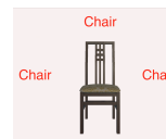
Figure 4: Custom marker for furniture placement

Vuforia [8] was used for marker recognition, since it is, at least at the time this article is written, the only framework that allows this feature on HoloLens. Markers were specifically designed for this application and represent the furniture along with its name (figure 4). The colors and contrasts were engineered for maximum recognition success.