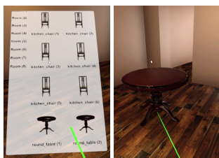
Figure 2: VR interface for choosing and placing furnitures.

Mozart's last standing house in Vienna [6] is currently a museum dedicated to the composer. Unfortunately, the residential part is completely empty, even though a list of the pieces of furniture was retrieved from legal documents of the time. Therefore, this apartment is an enigma for the historians: the function of each room and the location of the furniture are unknown.