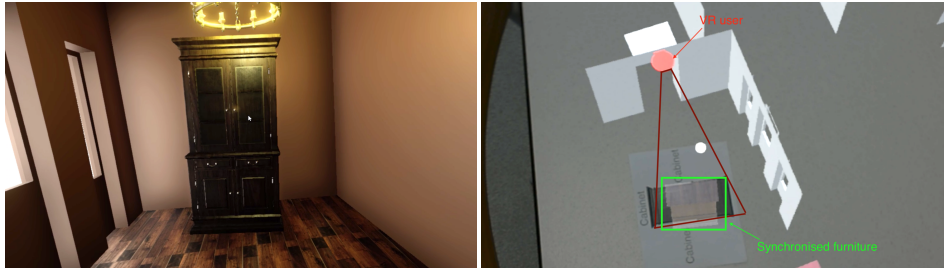
Figure 1: VR and AR visualisations of VirtualHaus. Both participants may interact with objects and apartment.