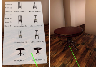
Figure 2: VR interface for choosing and placing furnitures.

Mozart's last standing house in Vienna [6] is currently a museum dedicated to the composer. Unfortunately, the residential part is completely empty, even though a list of the pieces of furniture was retrieved from legal documents of the time. Therefore, this apartment is an enigma for the historians: the function of each room and the location of the furniture are unknown.