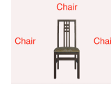
Figure 4: Custom marker for furniture placement

Vuforia [8] was used for marker recognition, since it is, at least at the time this article is written, the only framework that allows this feature on Hololens. Markers were specifically designed for this application and represent the furniture along with its name (figure 4). The colors and contrasts were engineered for maximum recognition success.