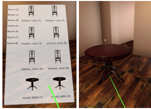
Figure 2: VR interface for choosing and placing furnitures.

Mozart's last standing house in Vienna [6] is currently a museum dedicated to the composer. Unfortunately, the residential part is completely empty, even though a list of the pieces of furniture was retrieved from legal documents of the time. Therefore, this apartment is an enigma for the historians: the function of each room and the location of the furniture are unknown.