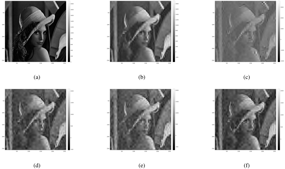
Figure 3: Comparison of the different pattern generalization methods for a compression rate \text{Cr} = 97.5\% and a batch size I_\ell = 16 . (a) Ground truth. (b) Split. (c) Inexact. (d) Shift variant. (e) Singular value decomposition. (f) Random.