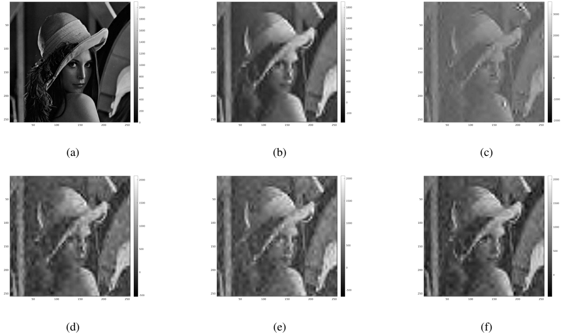
Figure 3: Comparison of the different pattern generalization methods for a compression rate \text{Cr} = 97.5\% and a batch size I_\ell = 16 . (a) Ground truth. (b) Split. (c) Inexact. (d) Shift variant. (e) Singular value decomposition. (f) Random.