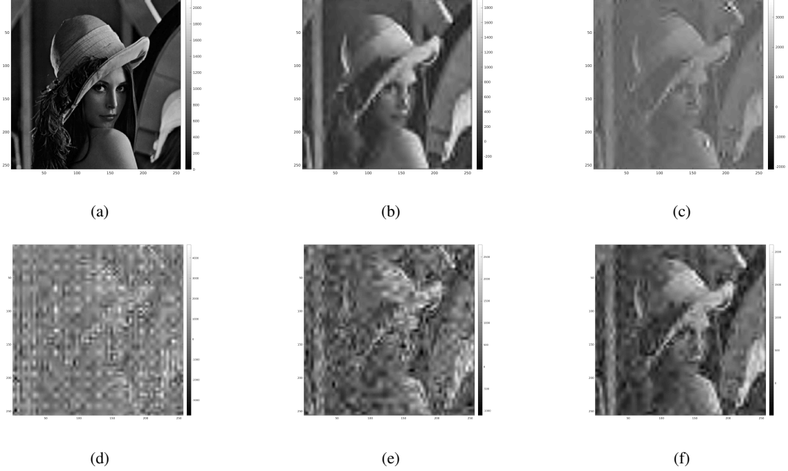
Figure 2: Reconstructions for the different methods for solving the full pattern generalization problem. The compression rate is set to 97.5%. (a) Ground truth. (b) Split. (c) Inexact. (d) Shift variant. (e) Singular value decomposition. (f) Random. The inexact factorization is computed using batches of size 16, to reduce the computational burden, while no batches are used for the other methods.