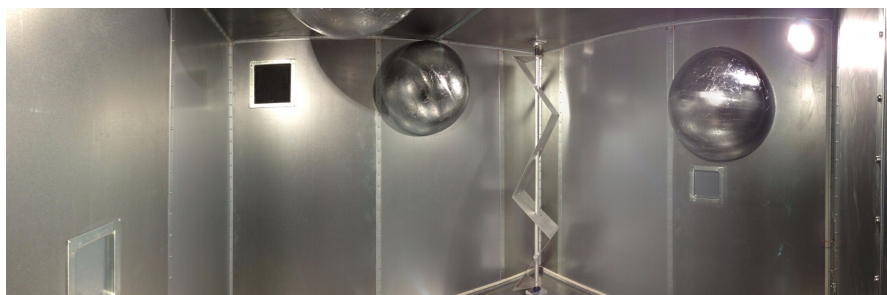
Fig. 1 180-degree photograph of the chaotic RC at ESYCOM. The commercial RC consists in a rectangular metallic cavity of dimensions W = 2.95 m, L = 2.75 m and H = 2.35 m and was modified by placing 3 hemispheres with radii of 40 cm (one at the ceiling and two on adjacent walls). The mechanical stirrer in the far corner can be seen.

These theoretical results as well as spectral statistical features like the so-called level repulsion between frequencies of the modes, the distribution of the widths of the resonances [19], or the distribution of the width shifts obtained through parametrical variation of the CRC [20] have been tested experimentally and confronted with measurements that are meaningful for the statistical requirements (for instance the uniformity criterion ) [16], which should be met in well-operating MSRCs according to the IEC standard [3].