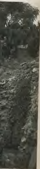
Fig. 1 View of the tophet, Carthage (Tunisia)

In her essay 2 Josephine Crawley Quinn emphasizes that it is impossible to distinguish clear-cut territories and identities in ancient North Africa because of the great amount of economic, cultural, and religious interaction between the different ethnic groups. 3 In other words, can we use the tophet, its rites, its inscriptions, or its material culture as a "marker" to define ethnic groups such as Carthaginians, Punic, Numidians, and Romans? In such a situation, we have to pose different questions, in particular, whether the tophet is actually a homogeneous archaeological and religious reality that is able to function as a cultural sign of Carthaginian or Punic ethnicity. For many ancient authors (writing in Greek, Latin, and maybe Hebrew) and modern ones as well, "human sacrifices" are considered typically Punic, but this is a non-native (etic) construction because nothing survived from the Punic literature that would have enabled us to understand the emic perception of the tophet rituals. So we must be careful in adopting labeled categories and, on the contrary, try to grasp the tophet's nature from a native point of view, avoiding modern lines of demarcation.