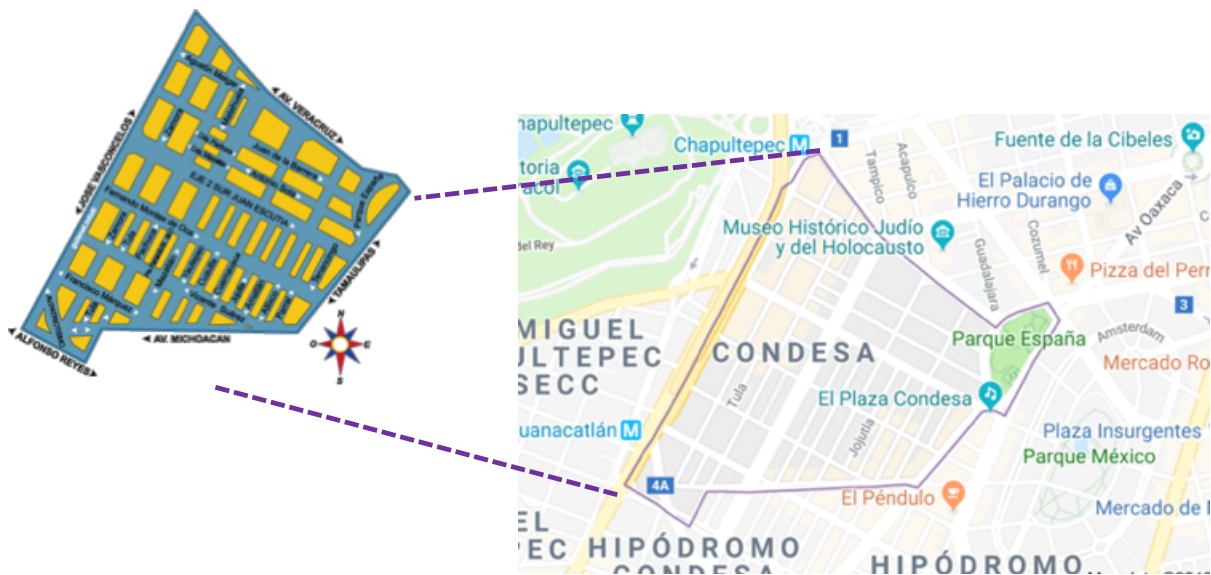
Figure 2 Google maps geographic description of La Condesa District in Mexico

classified as habitable and the remaining 842 are classified under "other uses". All these changes caused an increase in the price of the land, which went from $21,960.00 in 2012 to $27,500.00 in 2015.