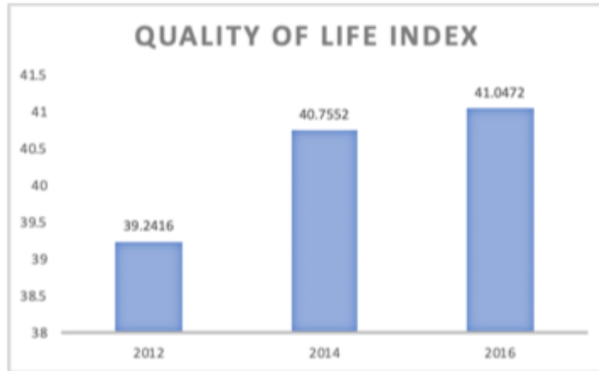
Figure 4 Index of QoL 2012 - 2016 in La Condesa

As seen in Figure 4 the QoL index shows that QoL as perceived by citizens is not very high. This means that they consider that life is acceptable but still services, security, income need public policies that can make life better. As shown in the figure QoL has become better comparing 2012 and 2016, but the increase between 2014 and 2016 was not very significant. Our first perception through the evaluation of QoL index, validates our hypothesis that other strategies are required to measure it. Combining quantitative and qualitative indicators is a first step to provide a more representative view of QoL. Yet it is not correlated with the type of policies applied that have been applied and how they are related to indicators. Our current work is devoted to study this aspect.