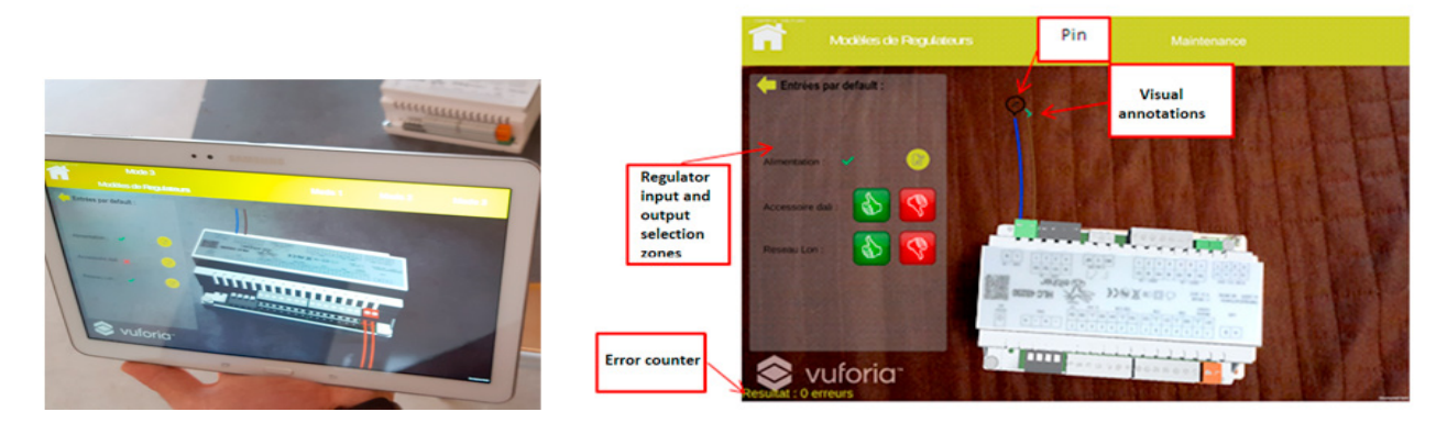
Fig. 2. (a) A screen-shot of the configuration guide module in augmented reality of the terminal controller; (b) A screenshot of the augmented reality maintenance guidance module.

verify the connection (see Figure 2-b). As this figure illustrates, by clicking on the pins the technician will have the choice between two checkboxes. He should click on the green button "correct" if the cable of his connected regulator (real model) is in the right place, or the red button "incorrect" if his cable is in the wrong place. To keep track of these checks, he will find instead of the pin a visual annotation. In addition, this module allows calculating the number of bad cables connected, the time of the execution of the task, the number of cliques and therefore to generate the report of results.