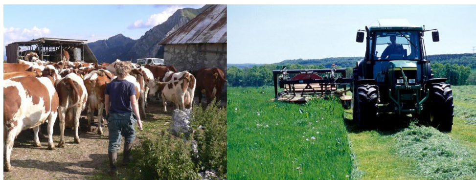
Fig. 1 The diversity of tasks performed on livestock farms requests human resources with different skills, as the employee who is going to milk (left) or the employee who operates a tractor to perform haymaking (right)

Semi-directed interviews were conducted with eight farmers and their 14 employees. Farmers were interviewed in November 2014 about changes in employees' activities since they were recruited. Three main topics discussed were (1) farm history: description of the structure and changes over