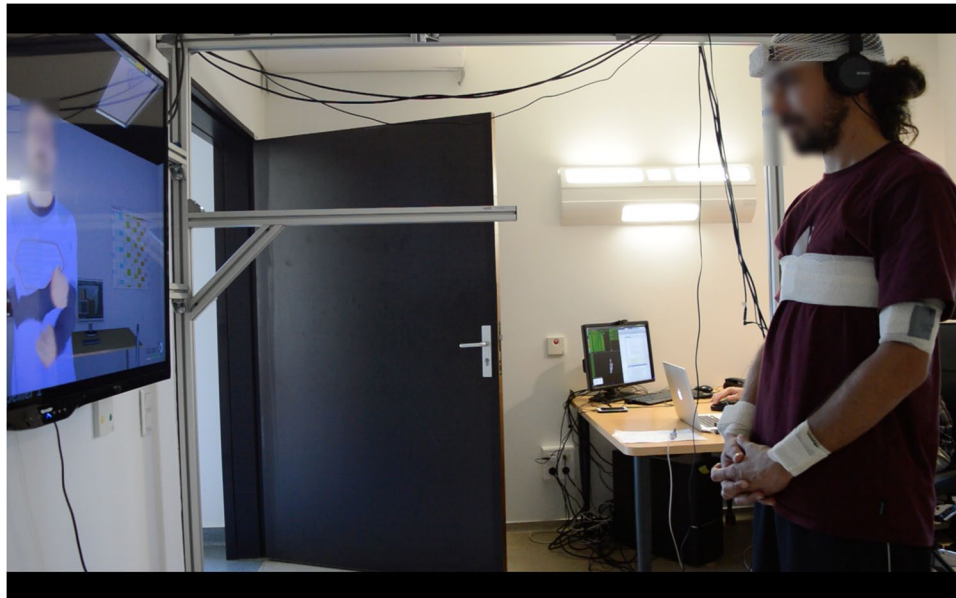
Figure 2. Picture of the interactive apparatus where participants stood up in front a photo-realistic 3D virtual agent displayed on a large TV screen. Sensors (IMUs) used to capture the motion can be seen on the head, torso, right arm and right forearm of the participant.

and self-other overlap also show inconsistent effects of mimicry in both virtual environment and traditional research settings, leading some researchers to suggest that the positive social effect of being mimicked is perhaps either not always consciously perceived or more fragile than generally reported in the scientific literature 41 . Finally, it should be noted that the key findings of this study showed remarkable effect sizes, suggesting that they may be relevant beyond mere academic interest.