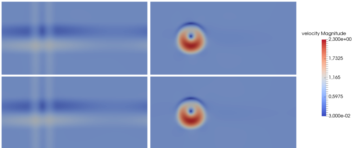
Figure 3: Traveling vortex test case with non-flat bottom. Mapping of the velocity magnitude at instant T_f = 0.1 obtained with the EXEX scheme (top) and IMEX scheme (bot) with \theta = 1 (left) and \theta = \mathcal{O}(\text{Fr}) (right).

we consider here a topography defined by z(x, y) = 10 \exp(-5(x - 1)^2 - 50(y - 0.5)^2) following the idea of [BALMN14].