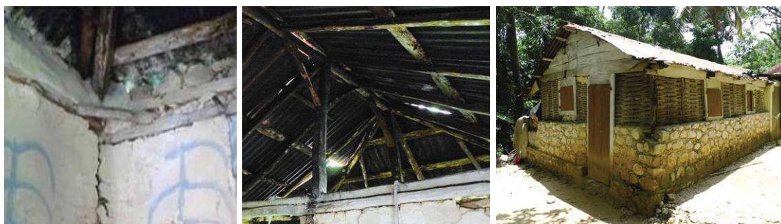
Figure 1. Grande Rivière : (a) bracing of the frame, (b) bracing of the roof structure, (c) gradual reduction of the thickness of the wall.

In addition to the technical characteristics of wood frame partitioning, the gradual reduction on the thickness of walls and use of lighter materials on the upper portions help protect occupants in the event of a partial collapse of the walls (Fig.1c).