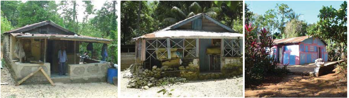
Figure 2. Grande Rivière : (a) disconnection of the structure of the gallery, (b) bracing of the gallery and decorative frieze (c) Cap Rouge: reduced height and vegetation barrier as protection against strong winds.

tures, and even if the lower masonry wall collapses, they maintain a relative consistency and a full collapse is thus prevented (Figure 2b). The decorative friezes adorning the gables help deflect the wind flow and thus minimize depressions likely to tear off roofs (Barré et al. 2011).