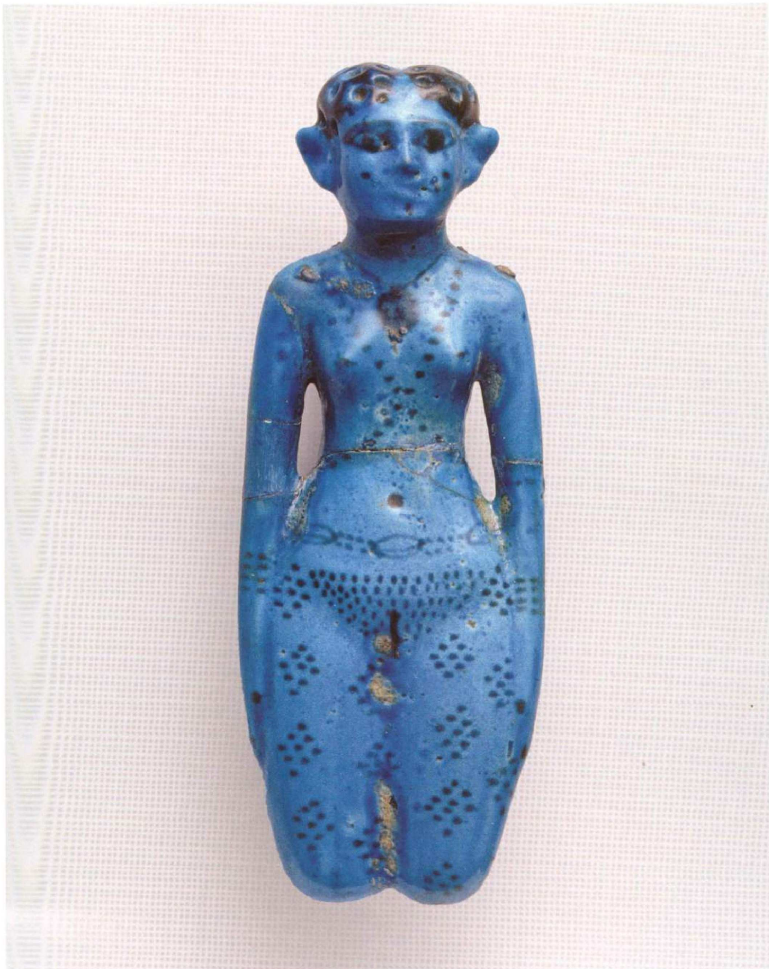
Deir el-Bahari-type concubine figurine. West Thebes, Egypt. Circa 1991-1797 BC. 12.2 x 49 cm. Siliceous faience Musée du Louvre, Paris. Inv. E10942.