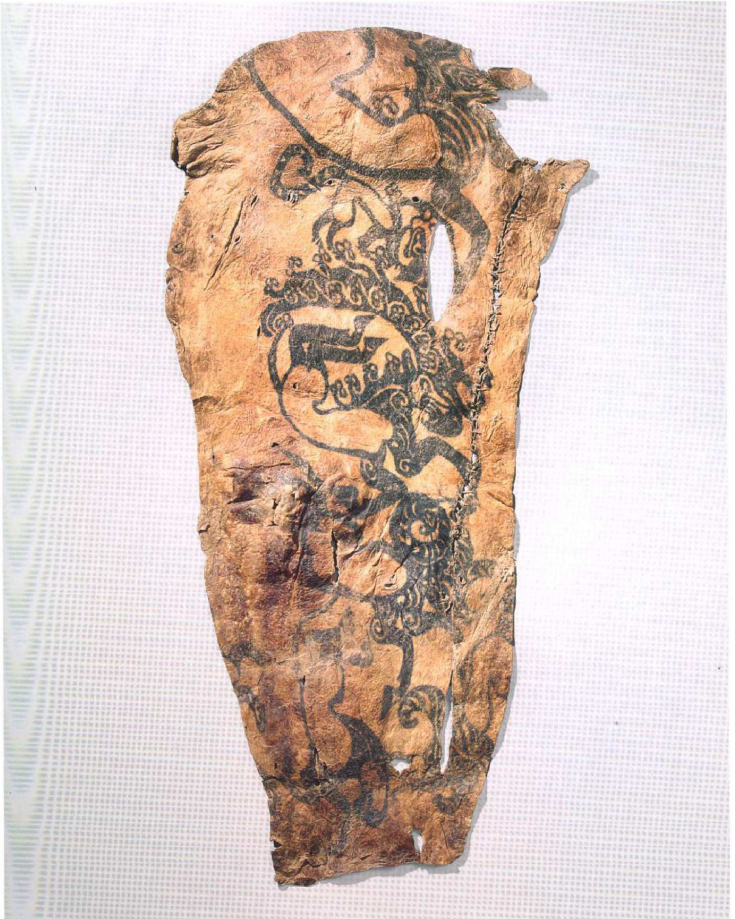
Piece of mummified skin, right arm of a Pazyryk chief. Altaï, Pazyryk, Burial Mound 2, Russia. Early 3 rd century B.C. 60 x 28 cm. Human skin, ink. Hermitage Museum, Saint-Petersburg.