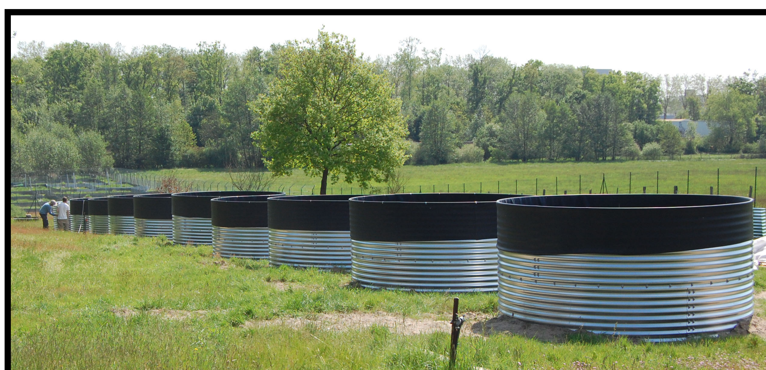
12 experimental tanks located at the biological station of Foljuif (CEREAP)