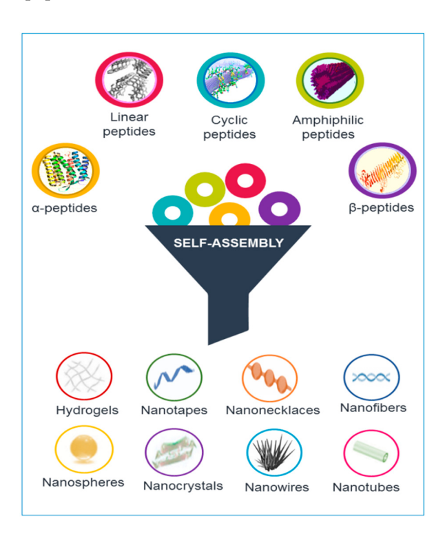
Figure 1. Different classes of peptides can be arrange in supramolecular structures handling the self-assembling phenomena. Various morphologies can be generated according to the rational design of the primary sequence.

Peptides are able to gather into assorted nanostructures, including nanotubes, nanofibers, nanospheres, and nanovesicles, supported by their device and self-assembly conditions [3]. Different types and structures of peptides, including cyclic and linear peptides, amphiphilic peptides, and \alpha -helical and \beta -sheet peptides, can self-assemble into nanostructures (see Figure 1).