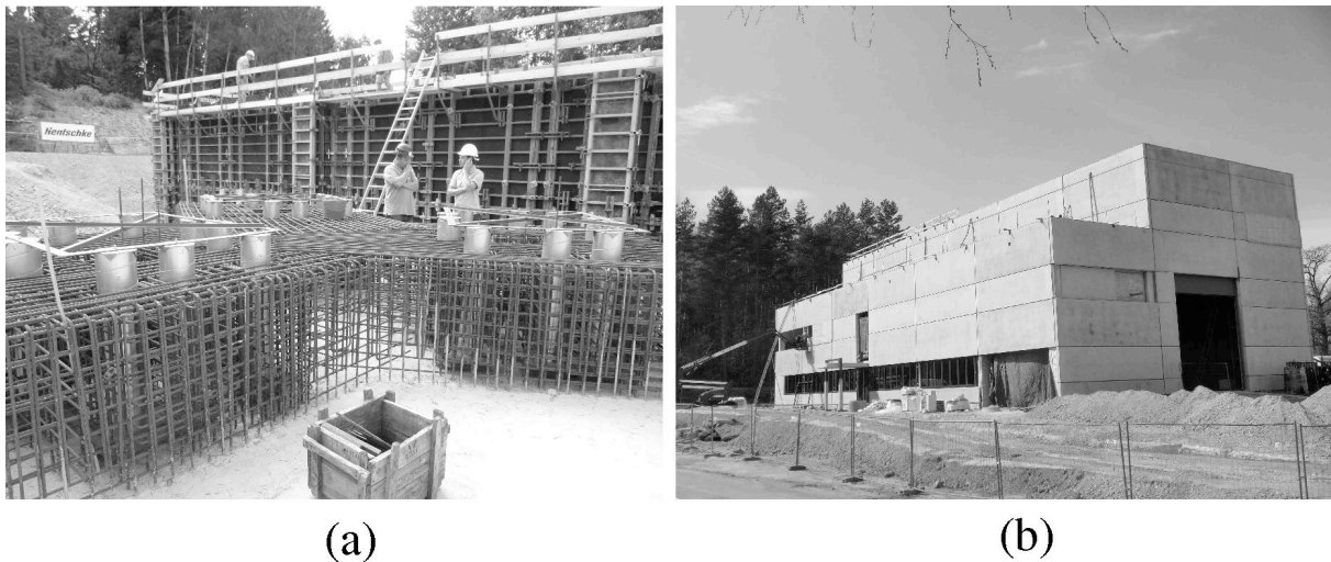
Figure 3: The DRESHDYN building: (a) Construction of the three feet of the precession experiment. (b) Present status of the shell construction (as of April 7, 2014).

The next step is the design of the bearings and of a frame that allows to choose different angles between rotation and precession axis. The choice of appropriate roller bearings for the vessel turned out to be extremely challenging, mainly because of the huge gyroscopic torque. It is the same gyroscopic torque that demands also for a very stable basement (Figure 3a), standing on seven pillars that are reaching 22 m deep into the bedrock. The dynamo experiment itself is embedded in a containment (Figure 2, right) which is supposed to prevent the rest of the building from the consequences of sodium leaks. With view on the double rotation, which could not be quickly stopped in case of an accident, this containment is the only chance for protecting the rest of the building from any jets that would spill out of a potential leak (...and cover perfectly all surrounding areas with burning sodium). For such accidents, the containment can be flooded with argon which is stored in liquid form.