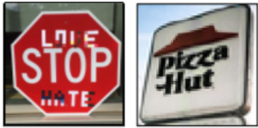
Fig. 1. Examples of a perturbed input (left image) ((Evtimov et al., 2017)) and an unknown input (right image)

trained independently, they will learn a different network classification function, and consequently they may act differently in front of an unlearned input. In fact, during the training process, the network progressively learns from its training samples to set the boundaries of its classes in a multidimensional space by optimizing a cost function. What allows the robustness of neural networks is that a classifier doesn't learn to only fit the learned examples into each class, but it generally defines the boundaries that separate the set of classes. Therefore, a big part of the empty multidimensional space is distributed to the learned classes, which allows DNNs to be easily fooled in front of an unlearned input. By using forced diversified DNNs, we hope that the different DNNs will not have the same boundaries between classes, and thus that unspecified inputs will be classified differently by some networks. Since we can not precisely know the boundaries of each network without extremely complex and costly analyses, we can not guarantee that this technique alone is sufficient to detect all or even most of unspecified inputs. We are nonetheless confident that it is an efficient first step, to be used with other complementary methods, in improving significantly the safety of DNNs.